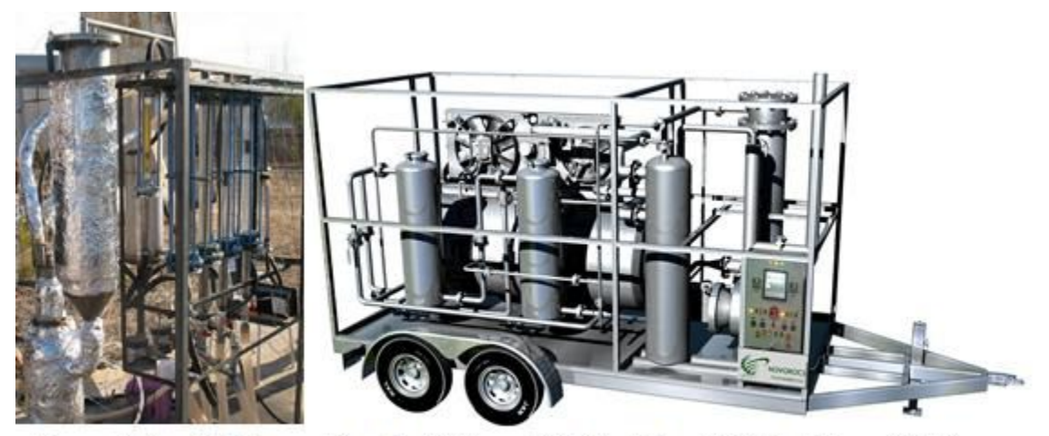
Figures: 1 Proof-of-Concept Reactor (left), and 2 Trailer Mount Field Prototype (right)

The proposed approach of first reforming the wellhead gas to natural gas has the potential to allow the use of natural gas generators with no loss of power or reliability, while reducing greenhouse gas emissions. For CNG and LNG applications, the reformer will convert the flare gas to methane without requiring expensive cryogenic equipment, enabling CNG and LNG production without the high capital cost of cryogenic liquid separation plants.