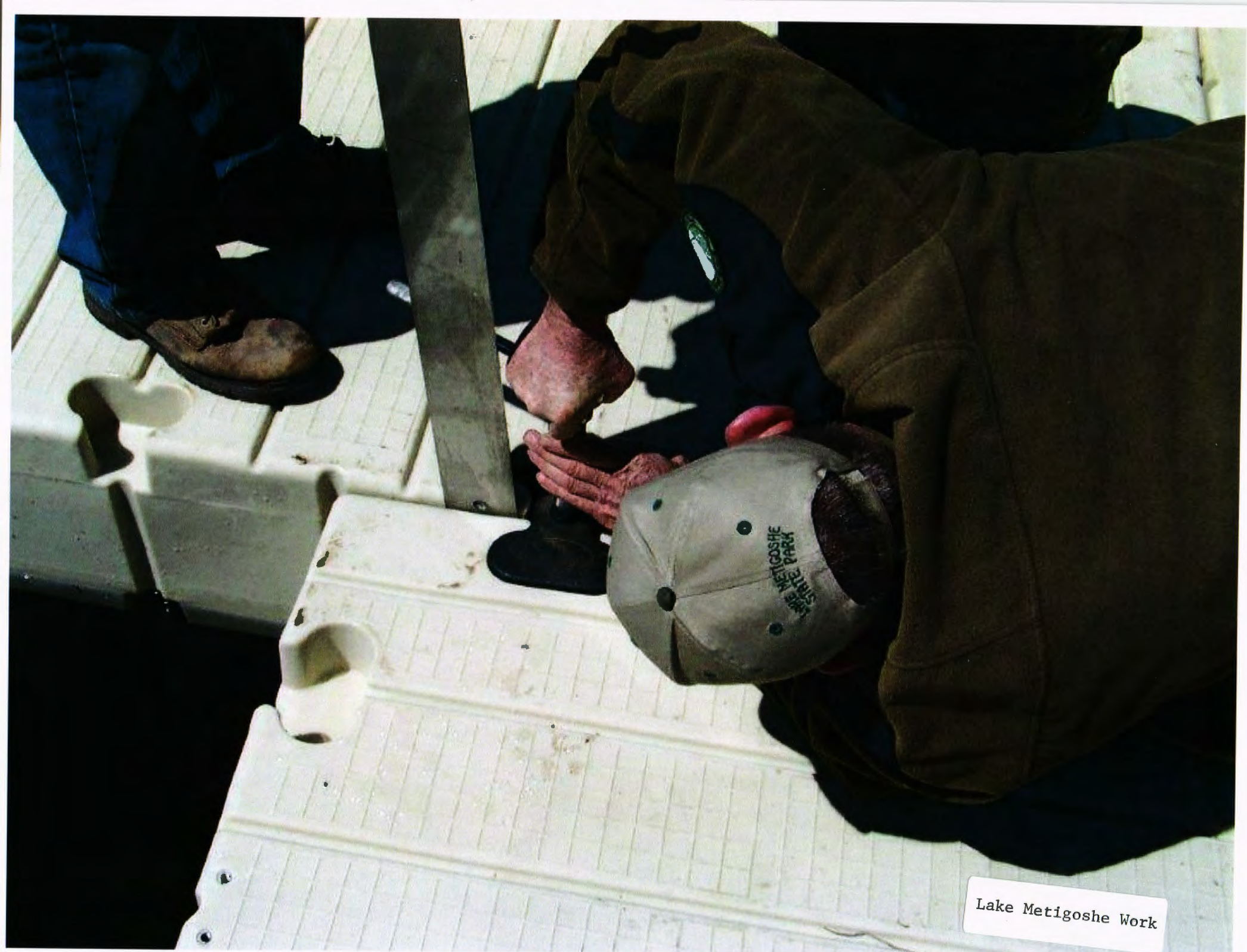
Lake Metigoshe Work