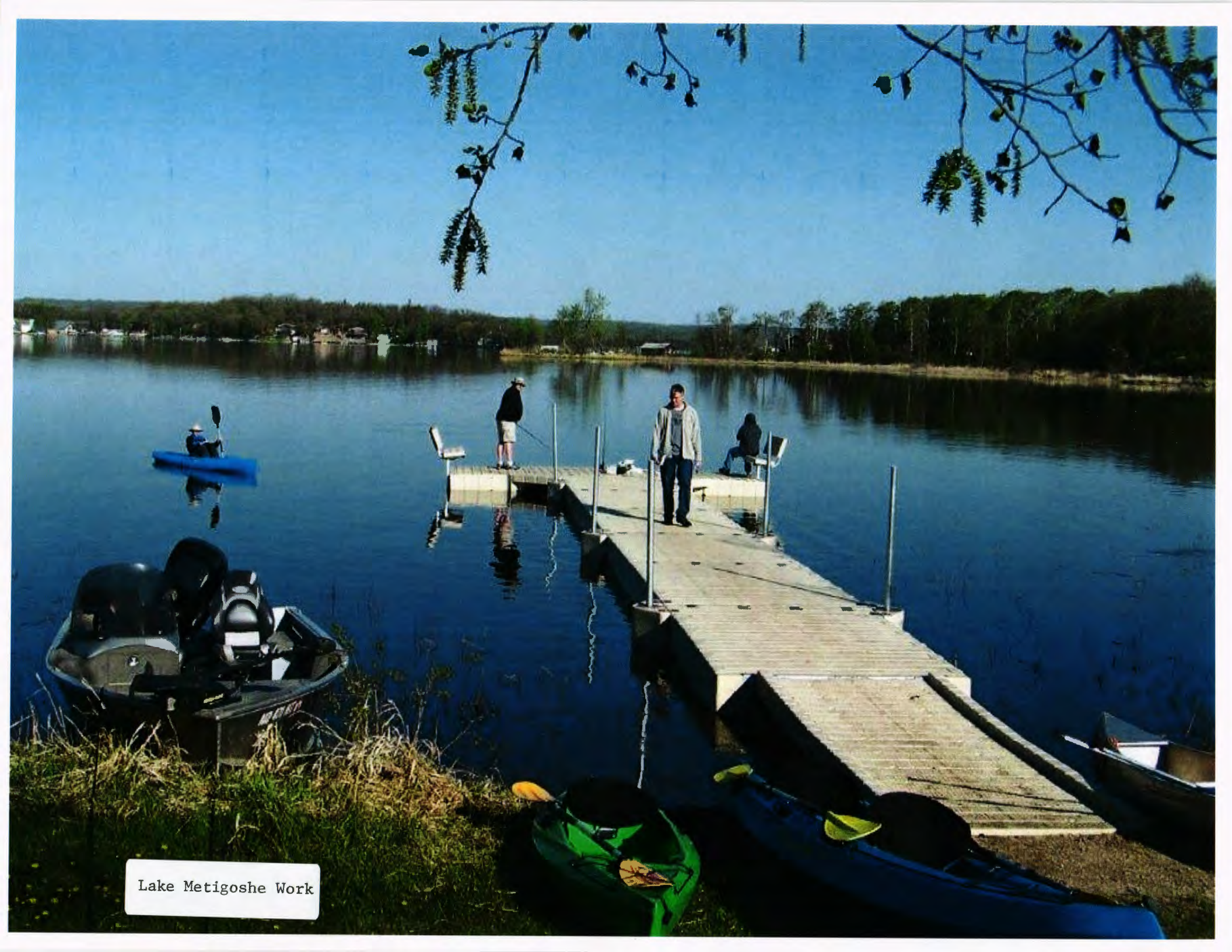
Lake Metigoshe Work