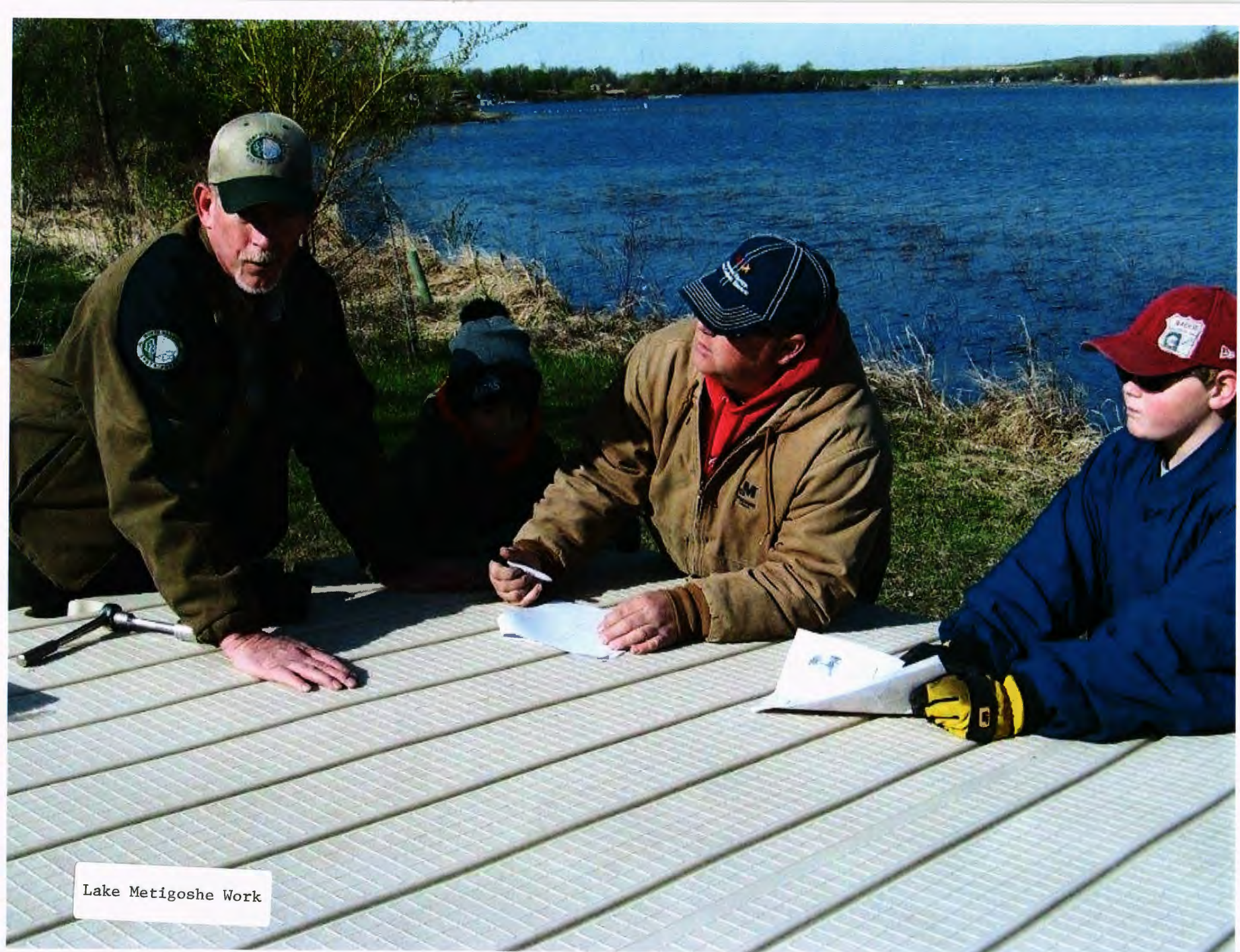
Lake Metigoshe Work