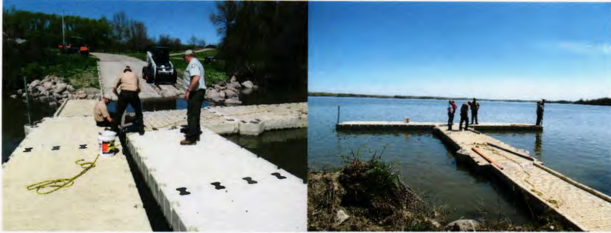
Photos 5 & 6: Installation of the new dock sections and placement of the dock.