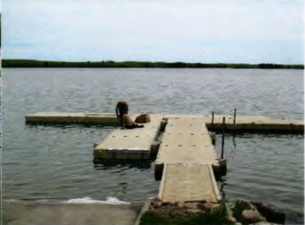
Photos 11-16: Completes gangway, preassembled dock sections, the assembly process and the completed dock.