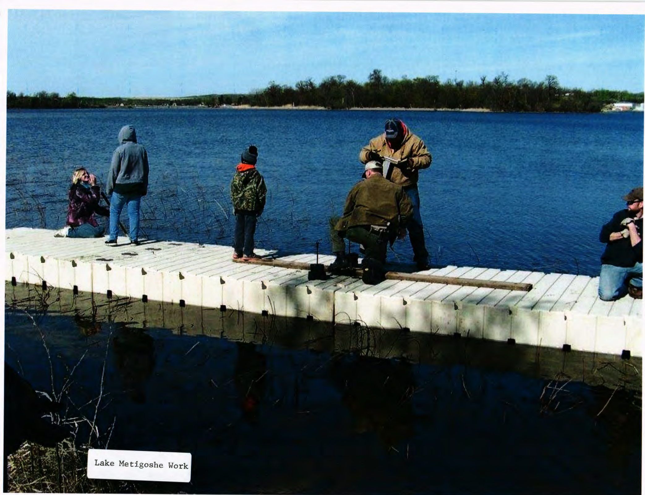
Lake Metigoshe Work