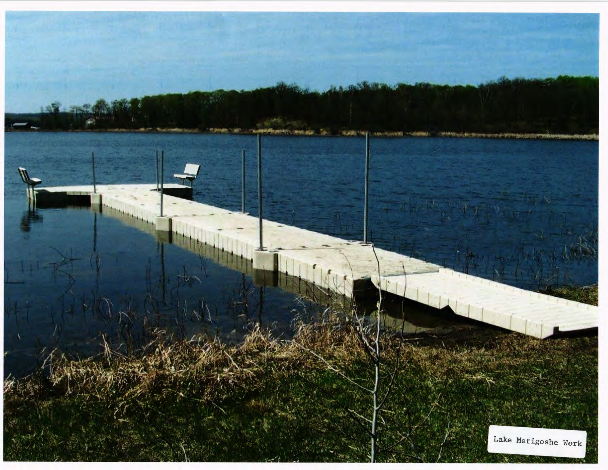
Lake Metigoshe Work