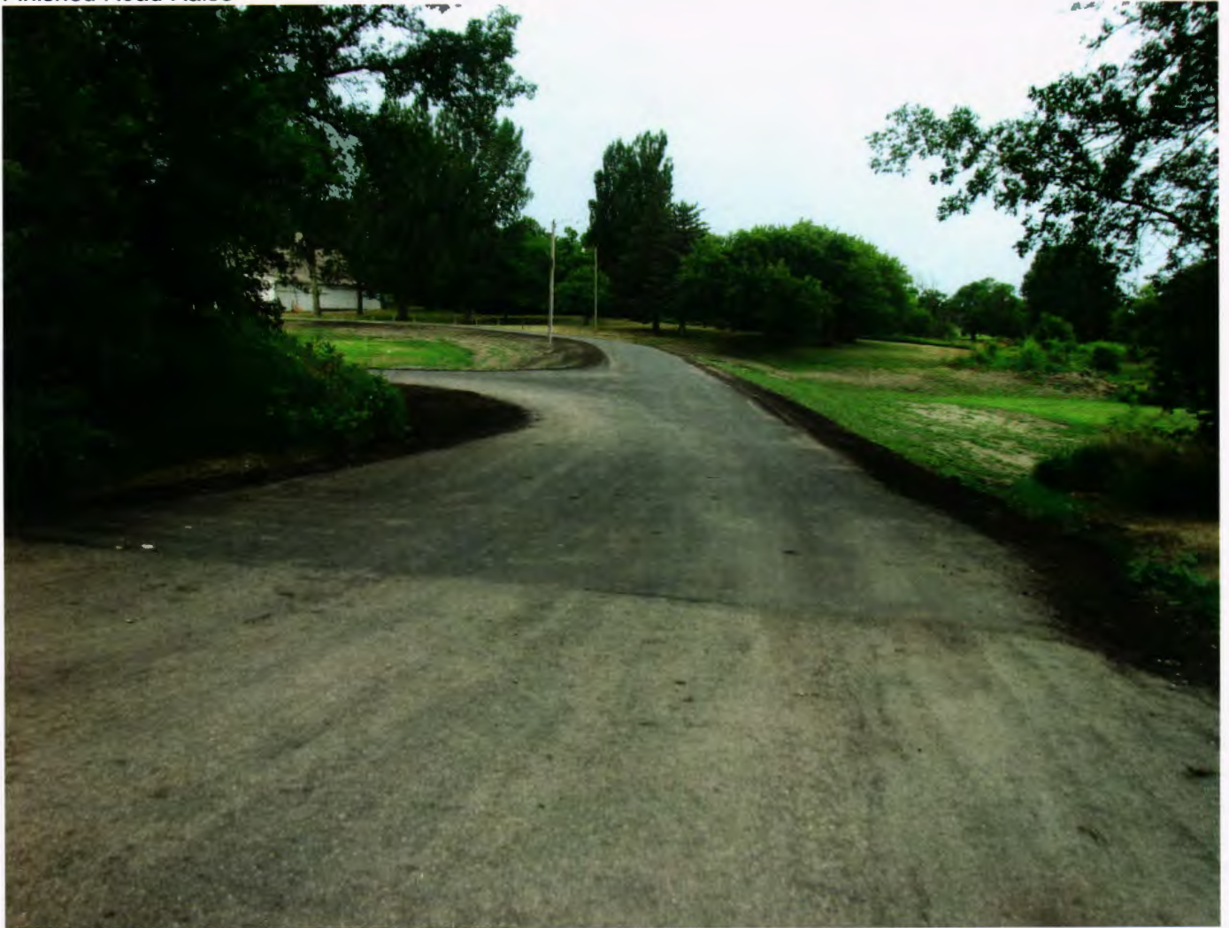
Finished Road Raise