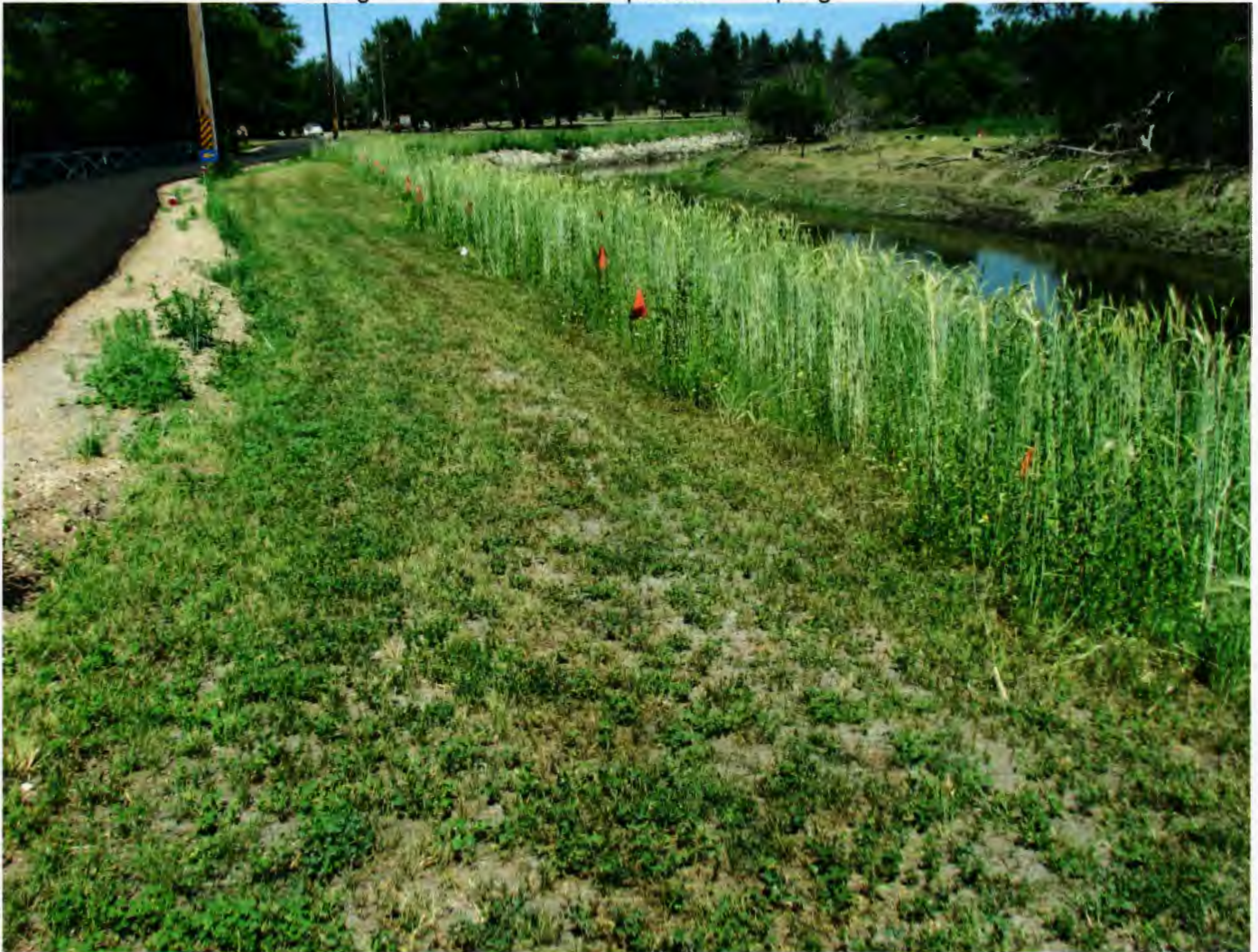
Finished streambank – each flag marks a tree or shrub planted this spring