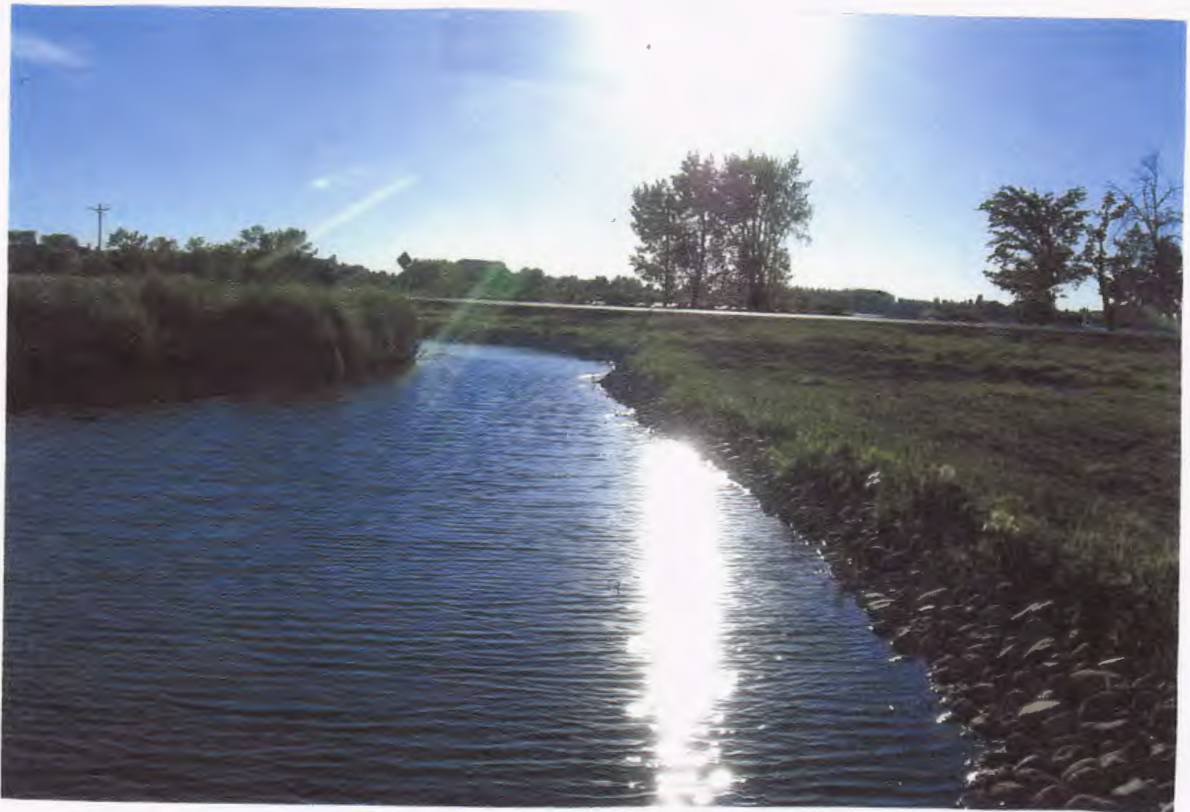
LOOKING WEST FROM EAST END OF ACCESS