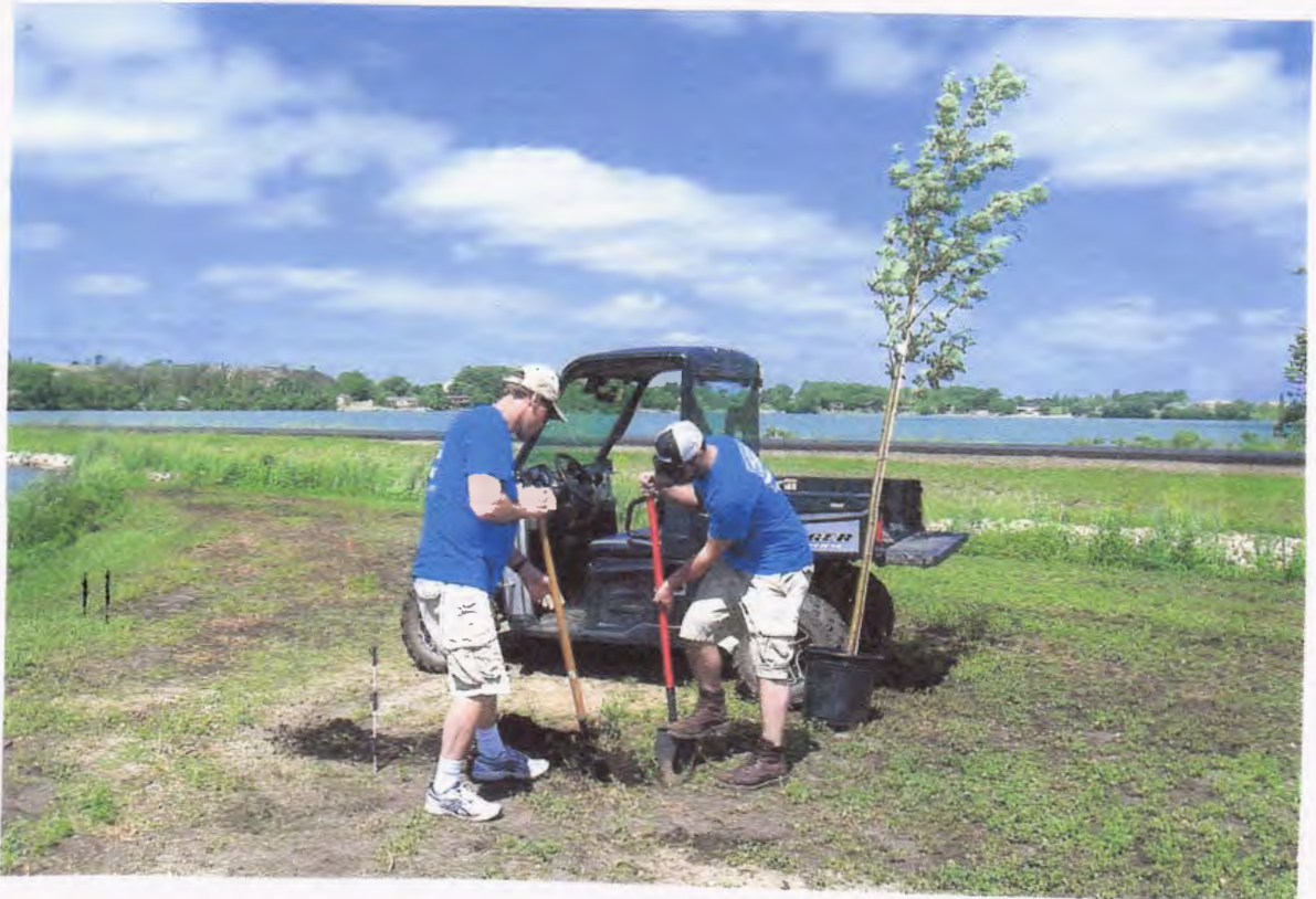
DOOSAN VOLUNTEER LABOR CAMP SITE