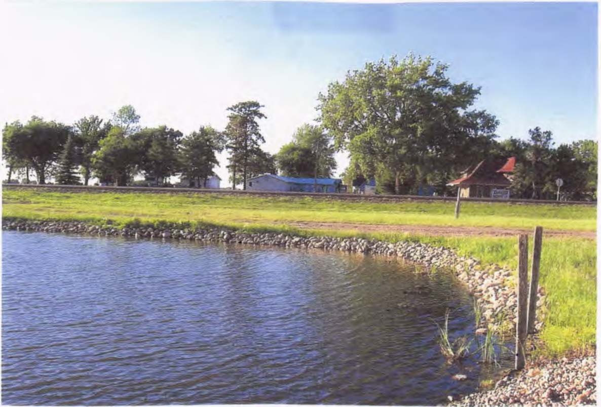
EAST END OF LAKE ACCESS