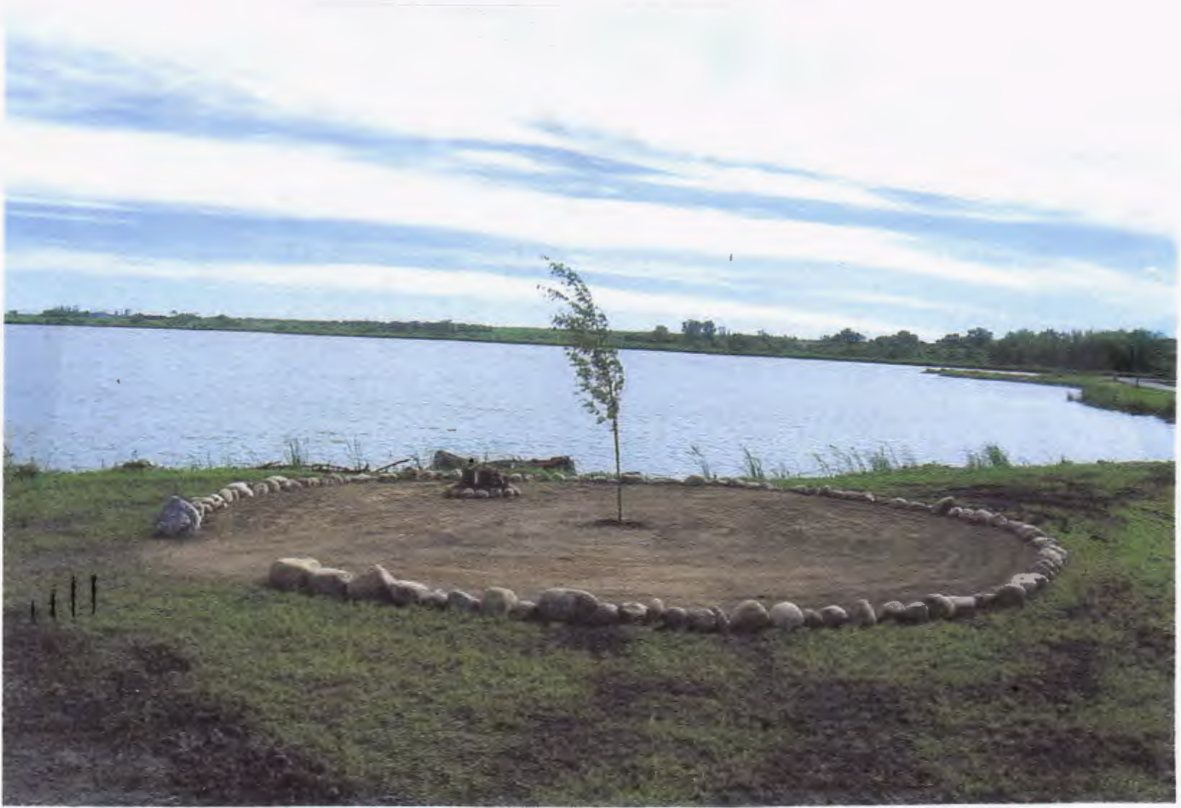
RUSTIC CAMPGROUND SITE