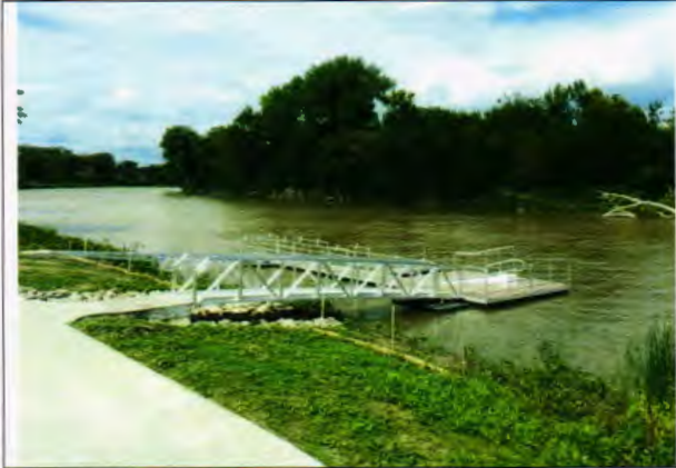
A view from the trail.