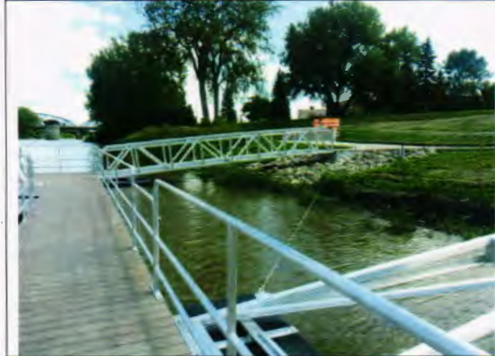
A series of guy wire attached to the dock and shore provide stability in high winds.