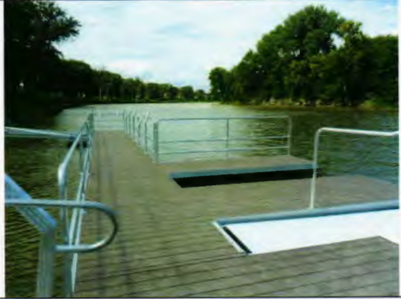
The length of the dock system.