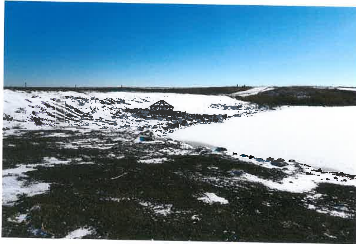
Schlecht Thom Dam