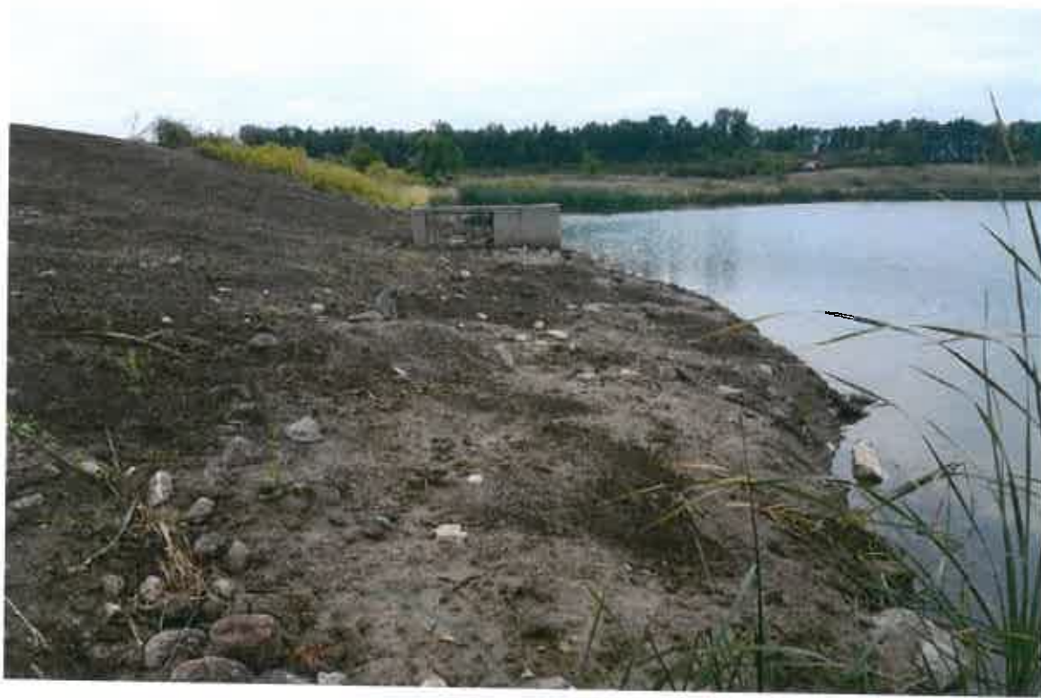
Kulem Edgeley Dam