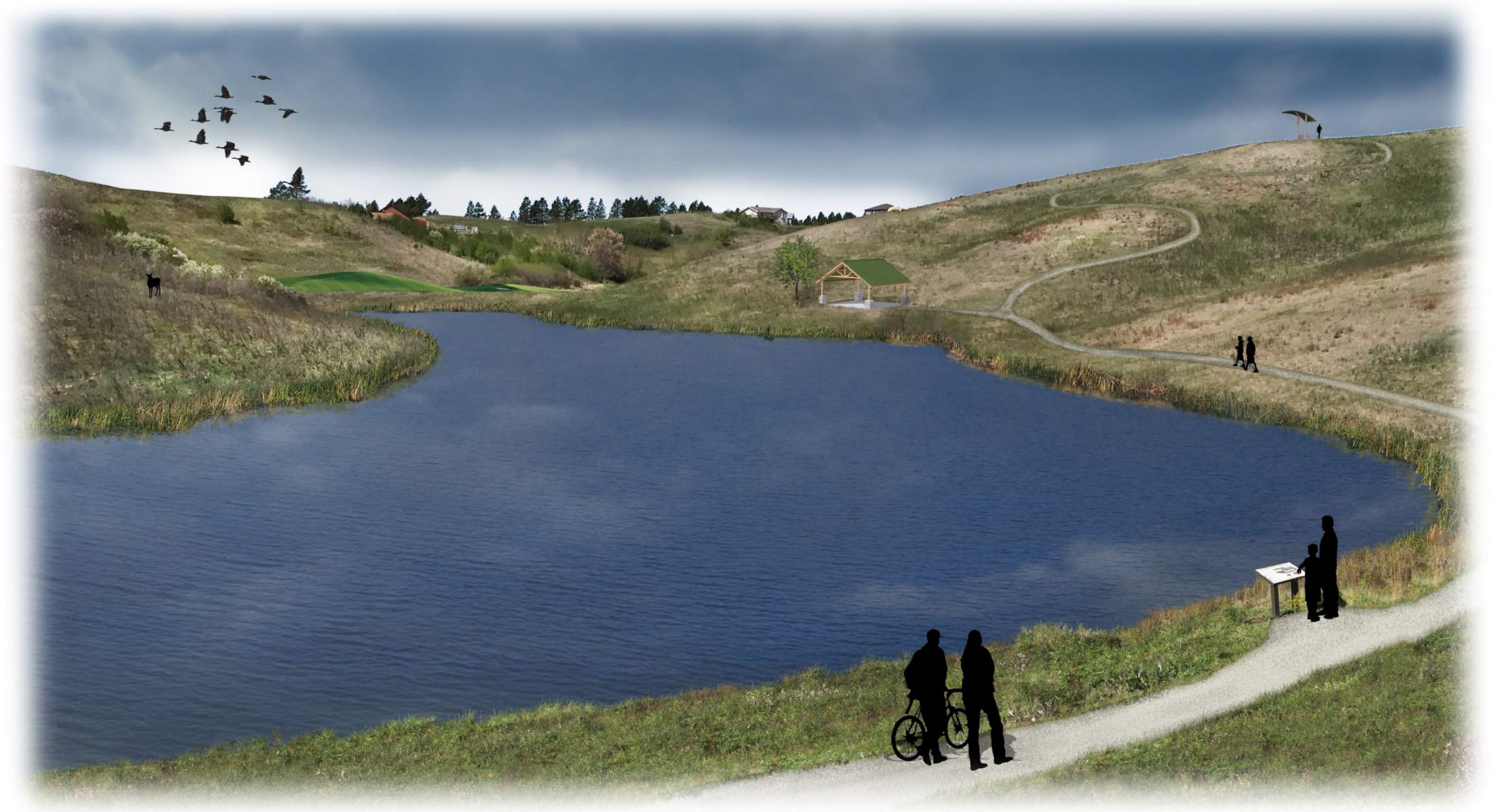
FUTURE TRAIL DEVELOPMENT OPPORTUNITIES