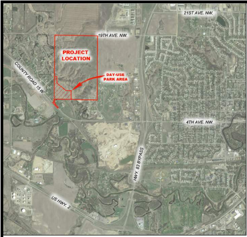
PROJECT LOCATION MAP - MINOT, NORTH DAKOTA