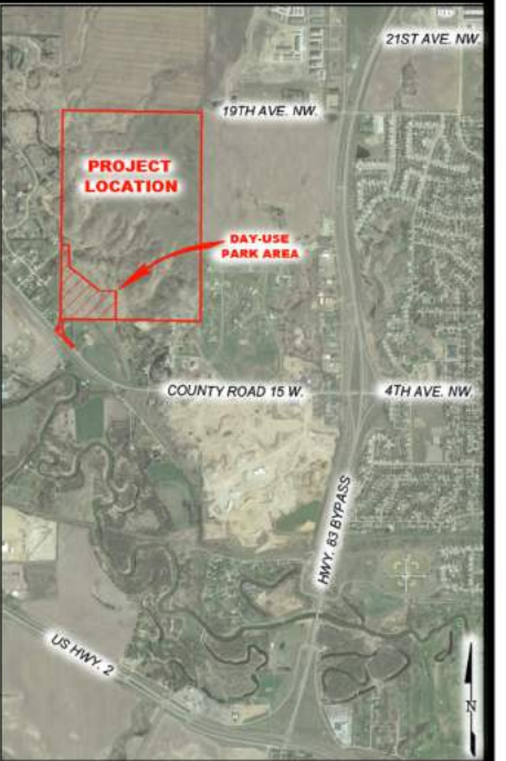
PROJECT LOCATION MAP - MINOT, NORTH DAKOTA