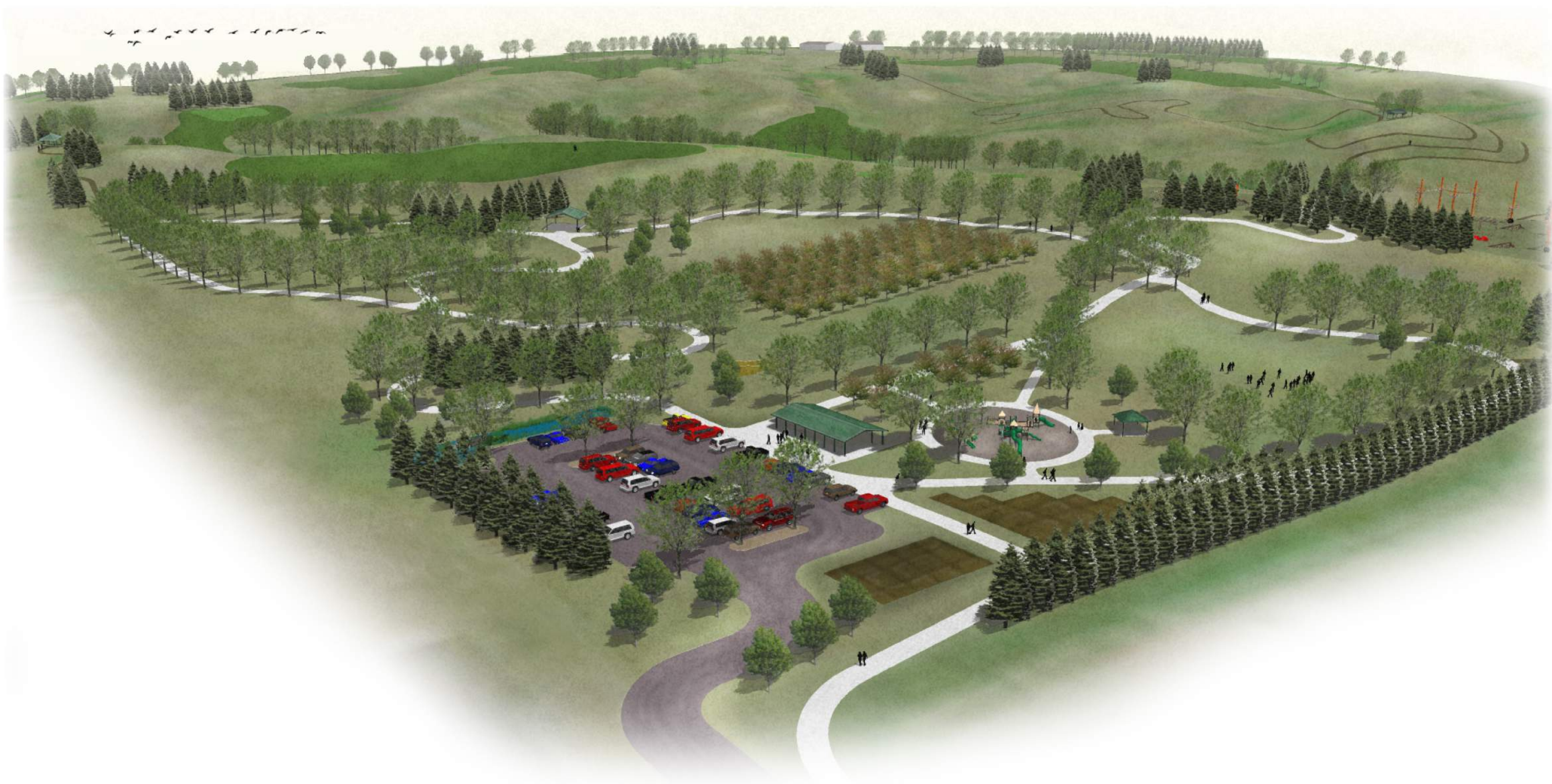
BIRD'S-EYE VIEW OF DAY-USE PARK LOOKING NORTHEAST