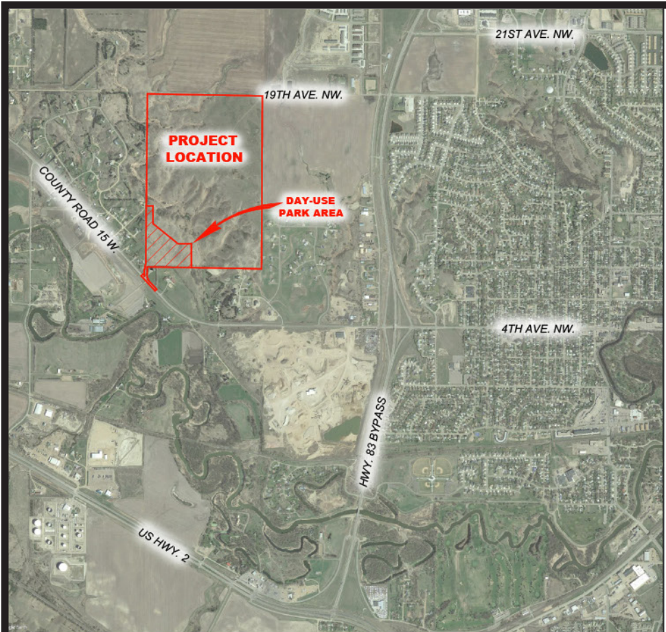
PROJECT LOCATION MAP - MINOT, NORTH DAKOTA