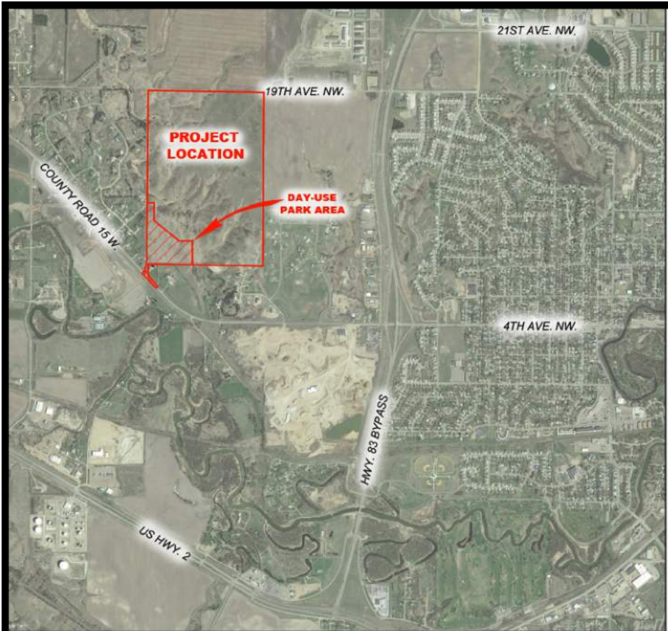
PROJECT LOCATION MAP - MINOT, NORTH DAKOTA