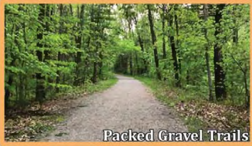
Packed Gravel Trails