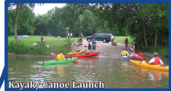
Kayak/ Canoe Launch