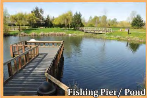
Fishing Pier/ Pond