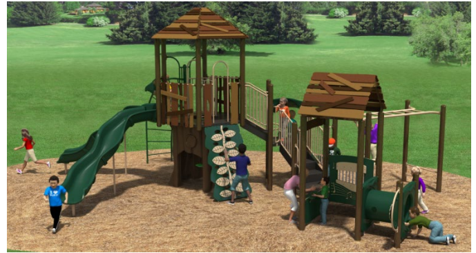
Rendering of new playground structure

In collaboration with Divide County, the State Historical Society of North Dakota seeks funds to help offset costs to purchase and install a new playground system at Writing Rock State Historic Site. Currently, the site has not had updated playground equipment in well over 30 years. Due to safety concerns, the site removed most of the equipment that was previously at the site. Currently, some swings and slides still stand at the site. The State Historical Society intends to remove the existing equipment and replace them with safe equipment with a nature-inspired look that blends into the landscape.