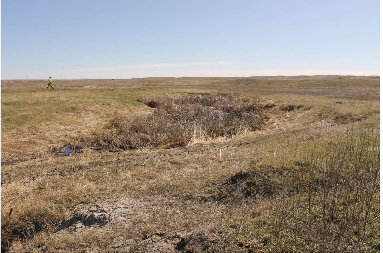
Former Meander Channel