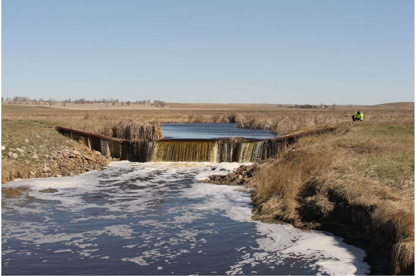
Lost Lake Dam