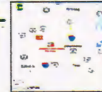
From GF, Fargo & Bismark