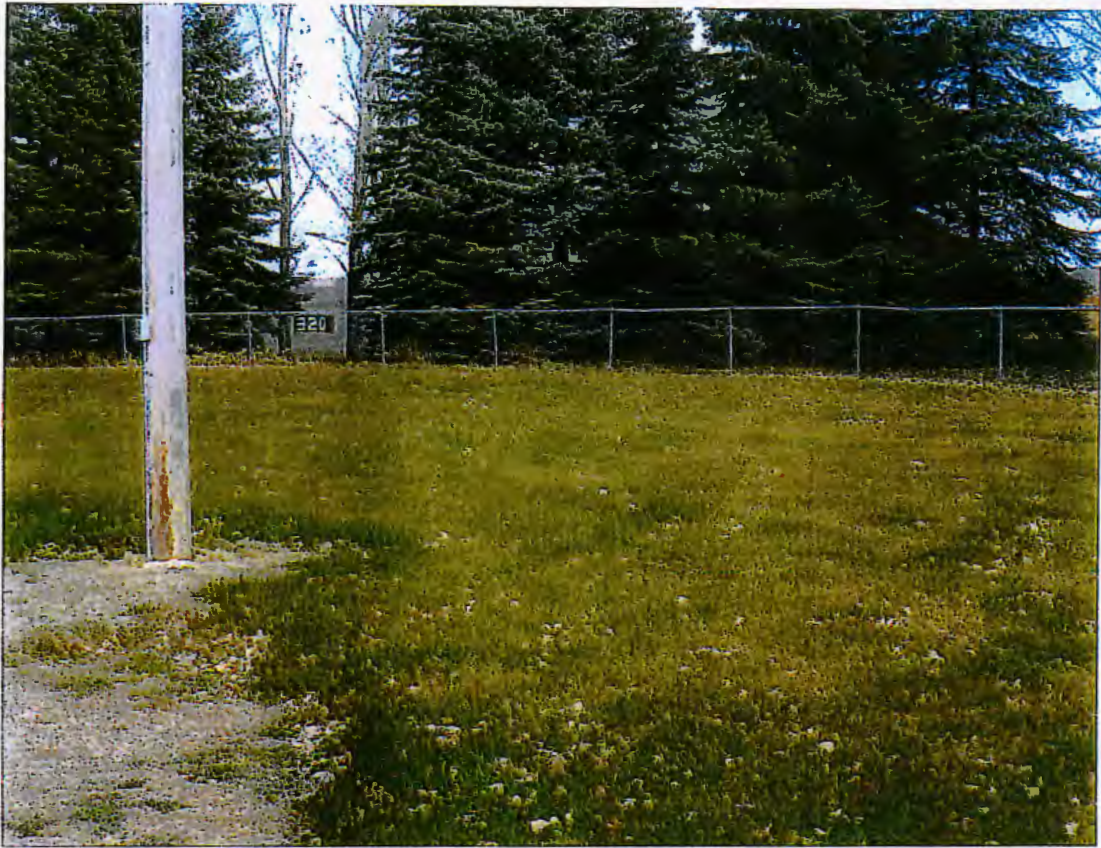
Playground site directly northeast of cafe