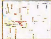
Map with streets

10 MILES SOUTH OF LAKOTA, NORTH DAKOTA (ON ND HIGHWAY #1)