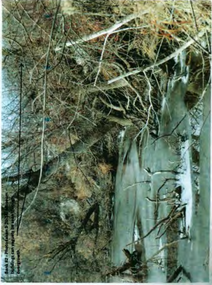
Bank #2 - Photofacem 3-20-17 buildings can vaguely be seen through overgrowth.