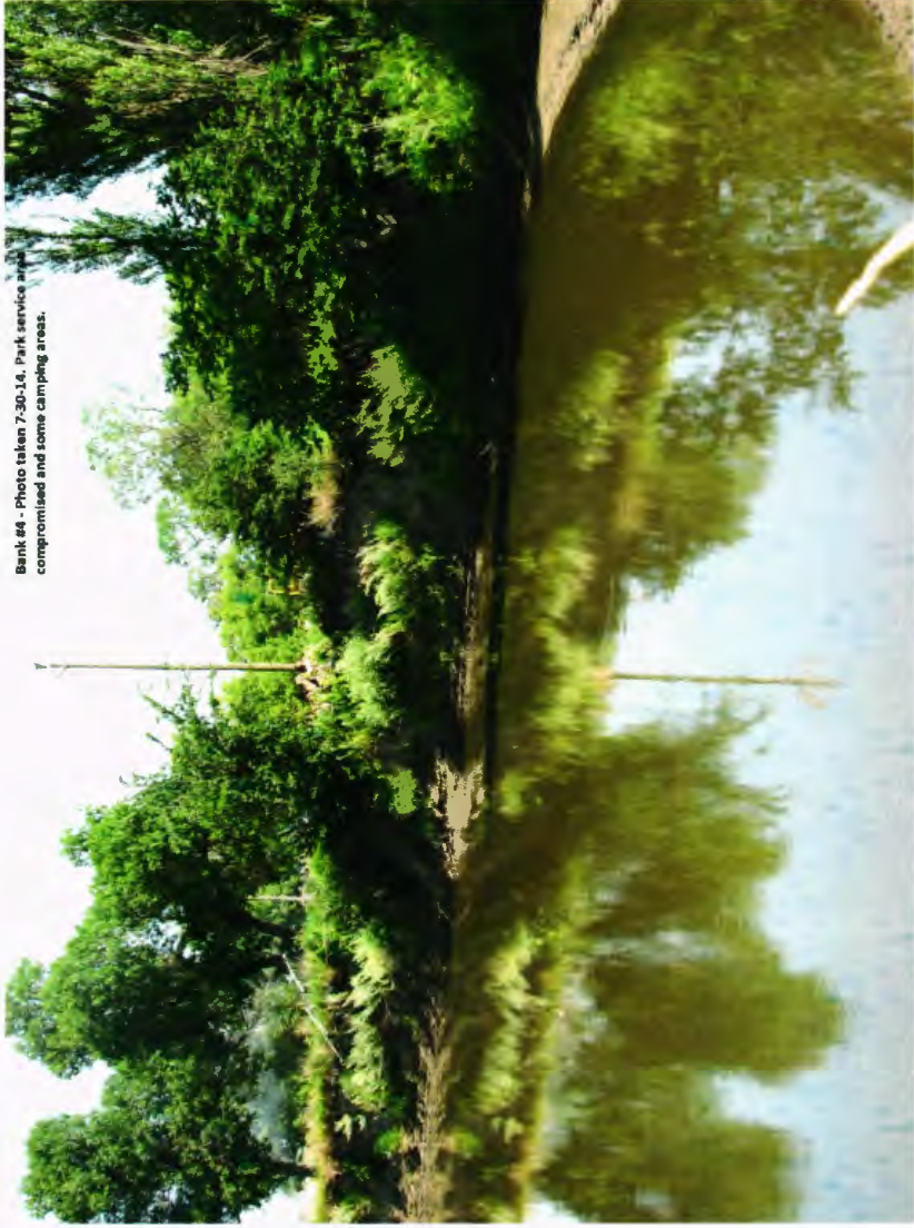
Bank #4 - Photo taken 7-30-14. Park service area compromised and some camping areas.