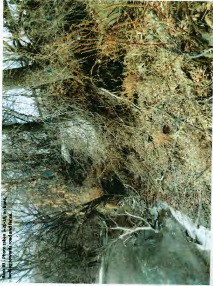
Bank 01 : Photo taken 8-20-16 on bank looking upriver road and fence.