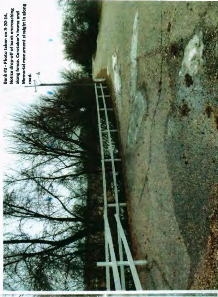
Bank #1 - Photo taken on 3-20-14. Notice drop-off of bank encroaching along fence. Caretaker's home and Memorial monument straight in along road.