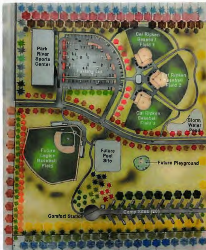
Proposed Tree Layout for Community Park