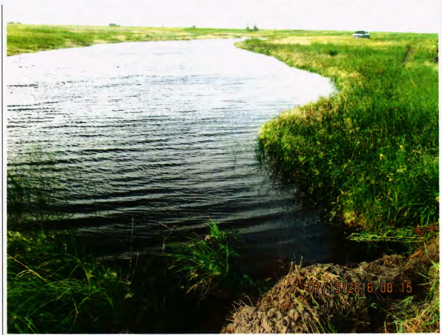
Newly restored wetland on the Long Lake National Wildlife Refuge G-19 project