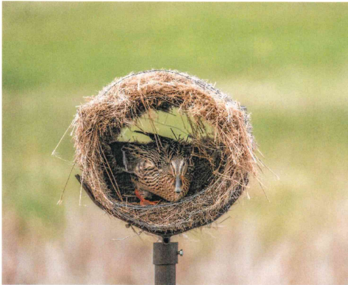
Figure 2. This mallard hen prepares to leave her nest in a Hen House near Woodworth, North Dakota.

wetlands, and waterfowl responded. The 2020 North Dakota Game and Fish breeding waterfowl survey detected the 13 th highest number of breeding ducks since the 1950s. Not surprisingly, the 2020 nesting season was very productive in Delta Waterfowl/OHF Hen Houses. Hen House Contractors definitively detected usage by ducks in over 60% of project nest structures in which occupancy could be determined, a significant increase from 2019 (35%). In some portions of the project area, the usage rate exceeded 80%. Figure 1 above highlights the Barnes Lake area in Stutsman County, where 19 of the 25 HHs were occupied last spring. When you include the total number of nests attempted (two of these HHs were used multiple times), the total usage rate in this area was 84%. The wetlands around Barnes Lake are a definite candidate for more HHs in the future.