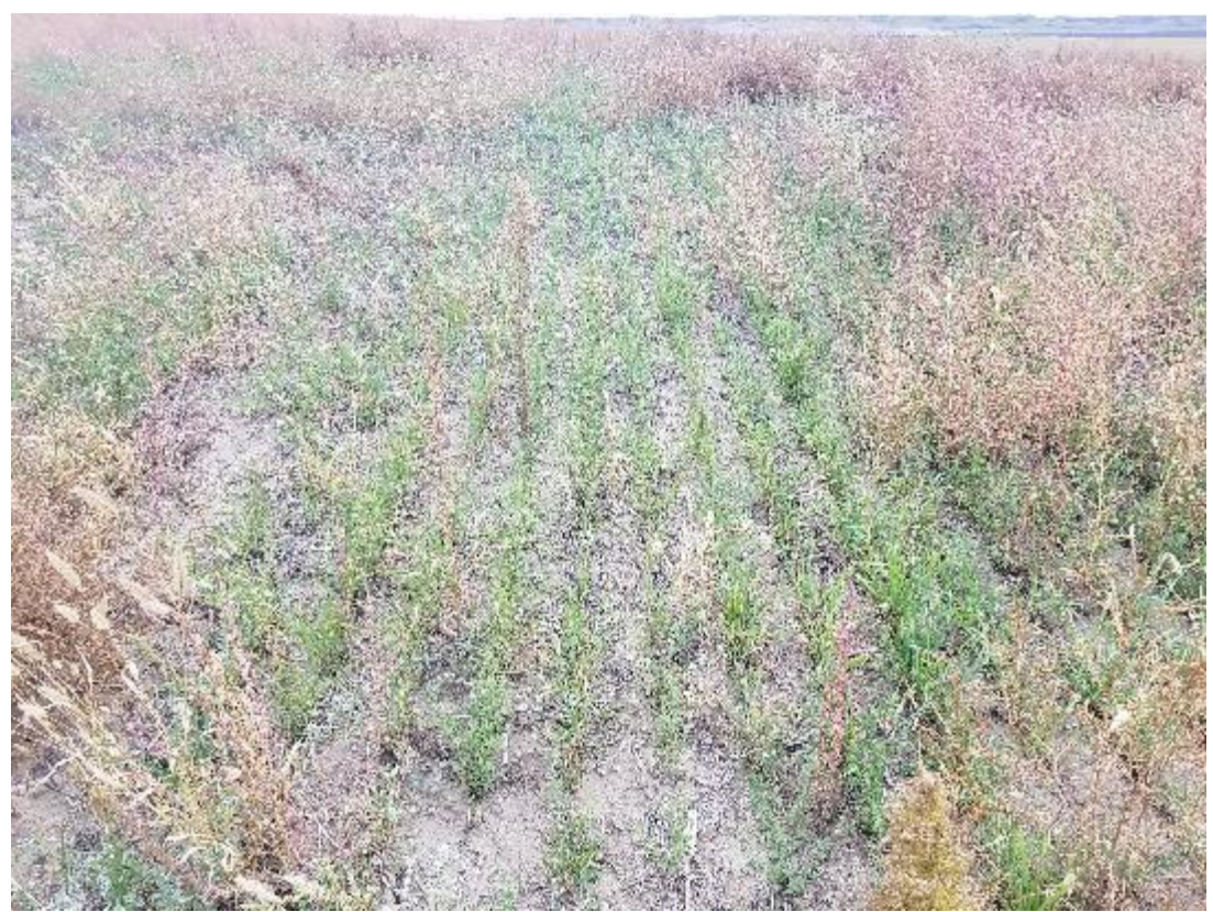
Figure 1. Newly established CREP grass planting, Emmons County, July 2017.