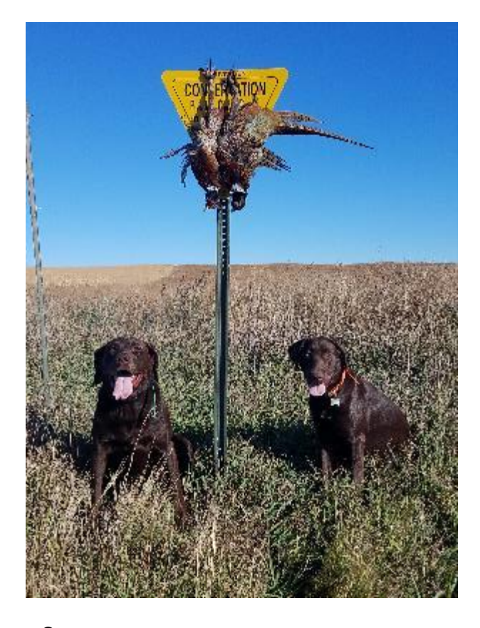
Figure 2 and 3. Established CREP grass planting, Emmons County.