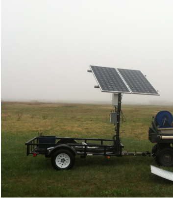
The solar trailer without protection