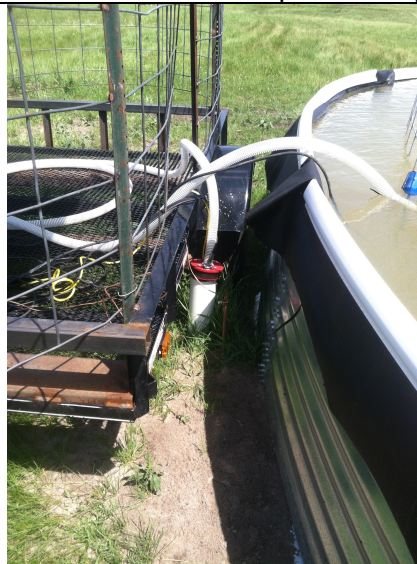
Protecting the well and hoses