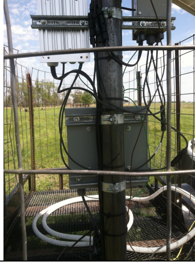
The solar trailer with protective paneling around it