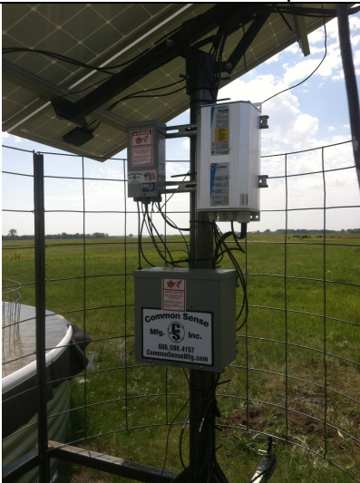
All controls protected by panels