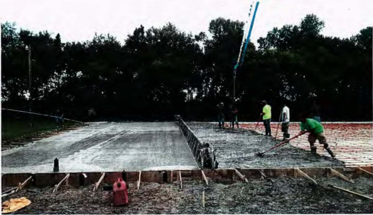
Pouring concrete with the assistance of contractors and volunteers.