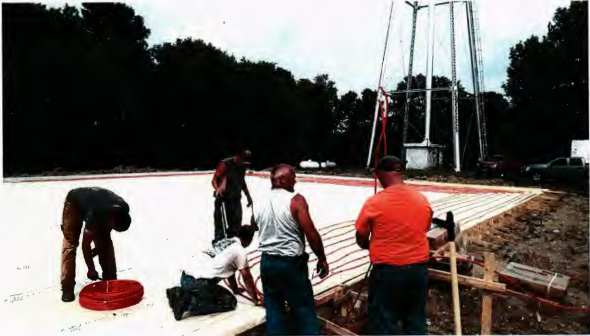
Installing the plumbing for floor heat.