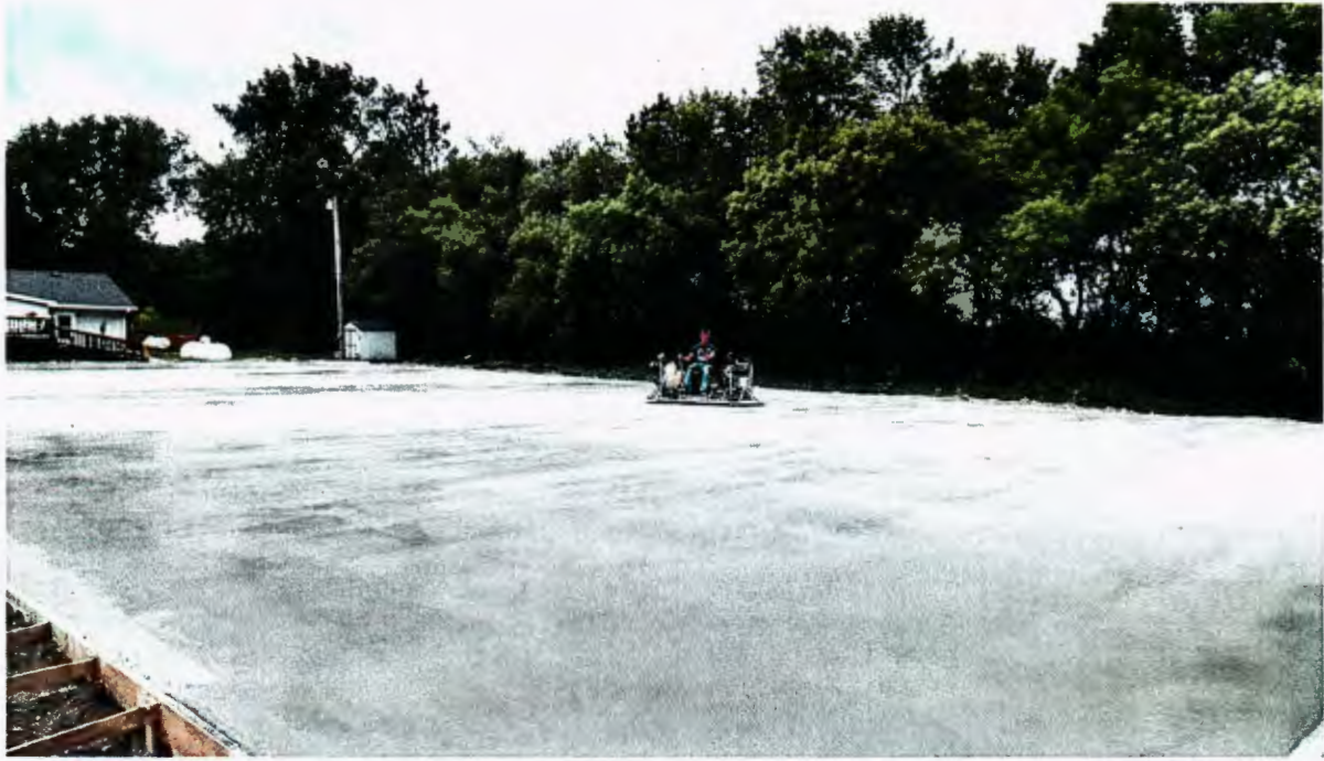
Finishing the beautiful concrete pad that will soon be home to the Norsemen Outdoor Education Center!