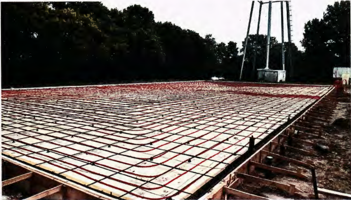
After hundreds of man hours of labor, our contractors and volunteers were ready to pour the concrete.