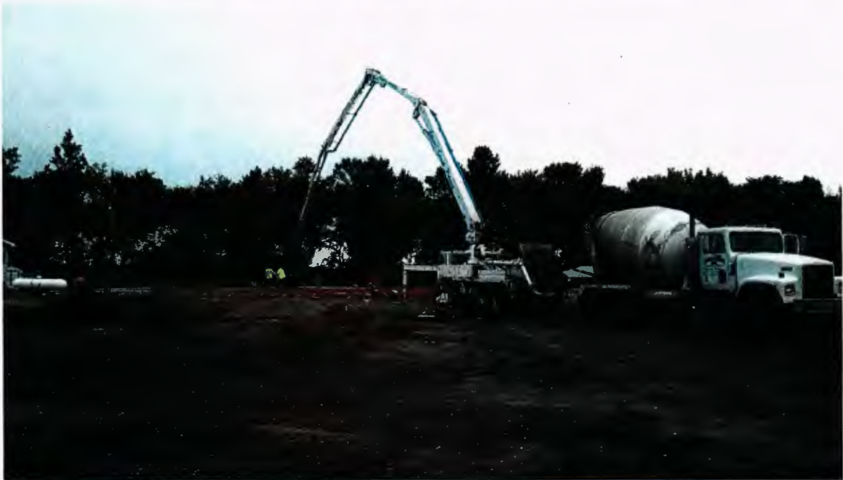
Another view of the progress.