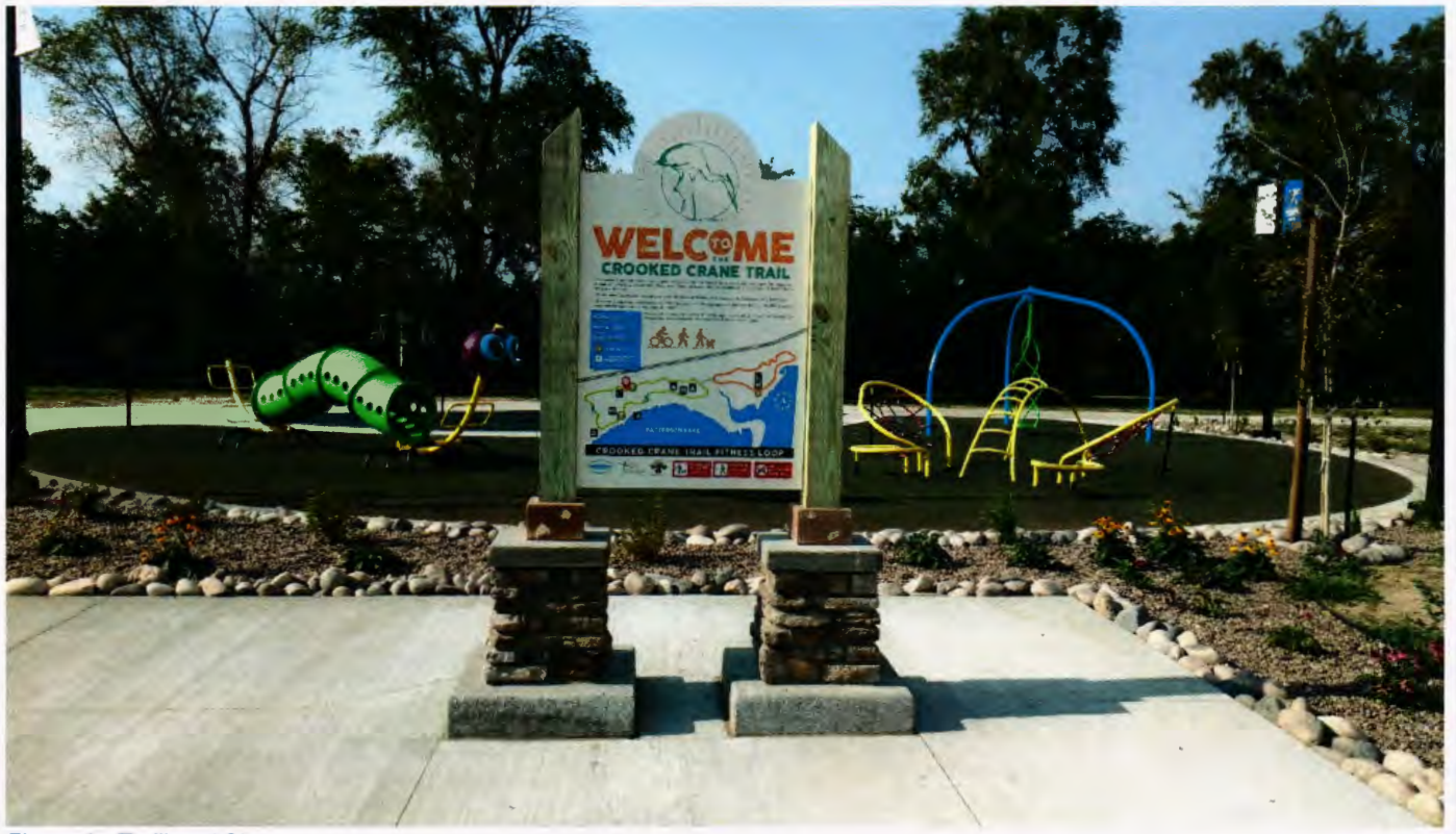
Figure 1 - Trailhead Sign