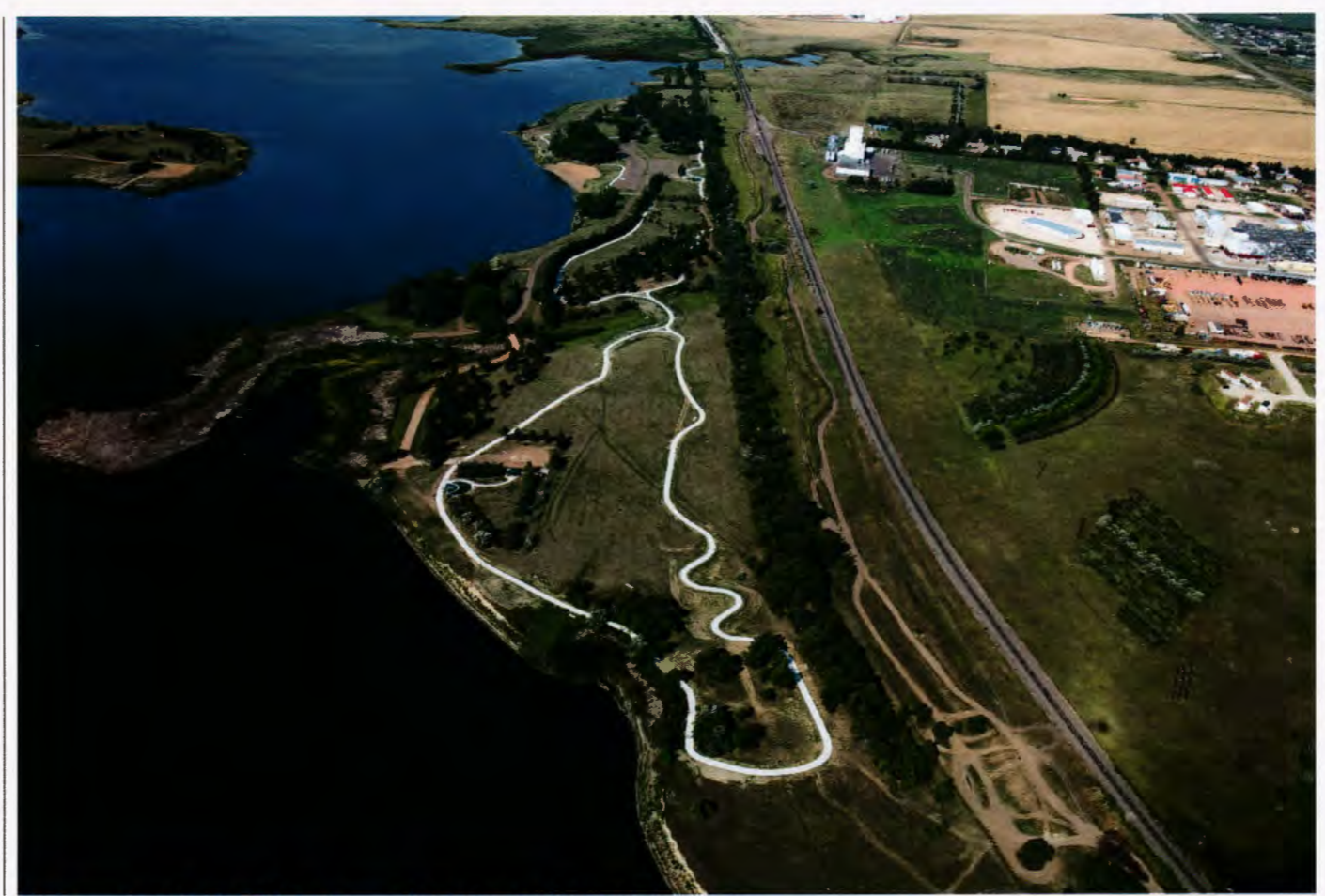
Figure 4 - Aerial Photo of Project Area