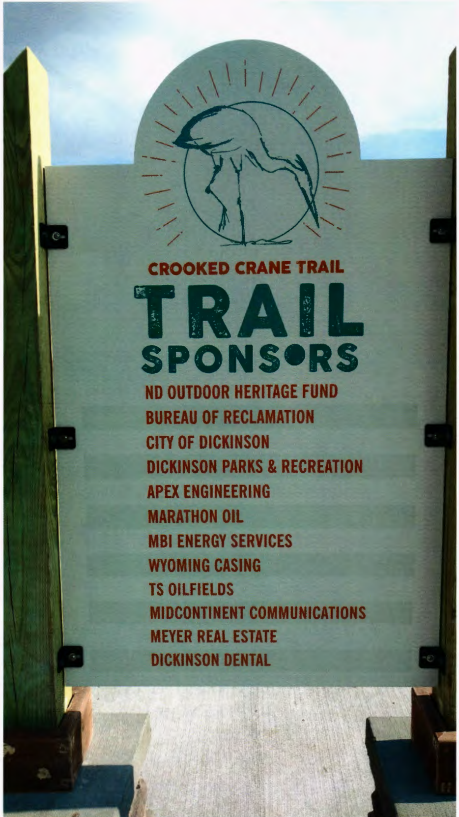
Figure 2 - Reverse Side of Trailhead Sign & Sponsor Recognition