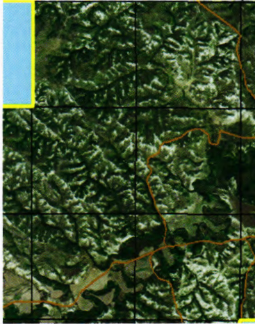
Figure 1 Field #6 & #9 fence work

Richard Ranch – Beach: South Unit covers the lower left half of map