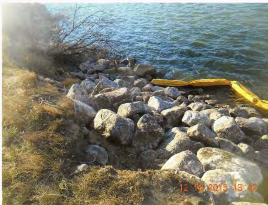
Riprap remains to be finished tomorrow