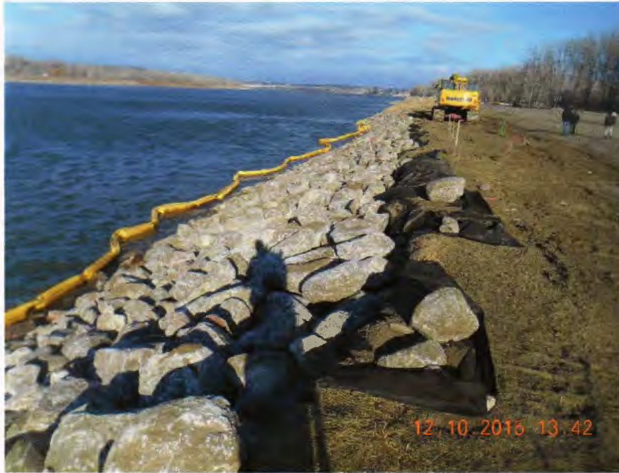
Riprap was widened out today