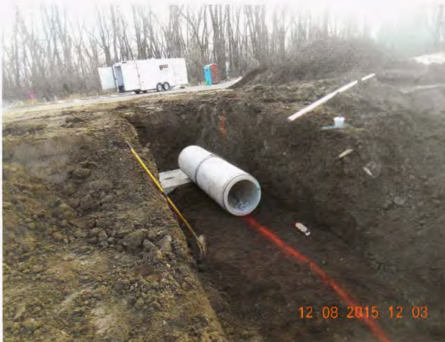
Culvert and Inlet Base