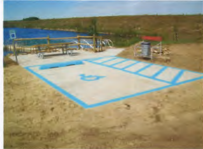
Accessible parking space