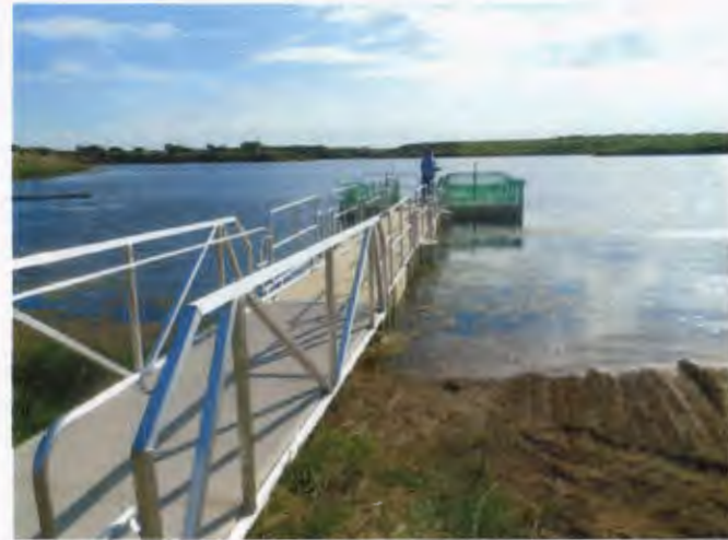
Accessible fishing pier