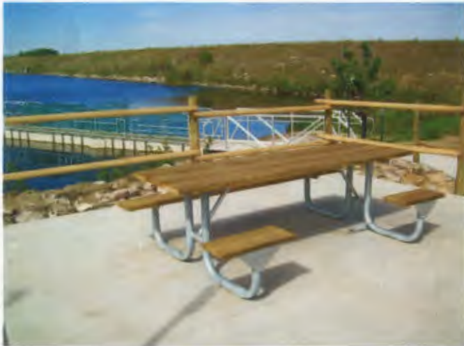
Accessible picnic table