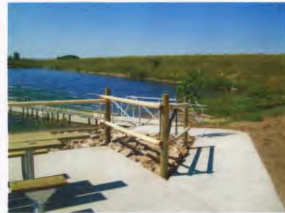
Wood fence and accessible picnic table