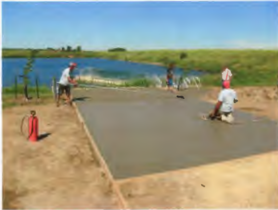
Pouring Concrete with Jim Zimmerman