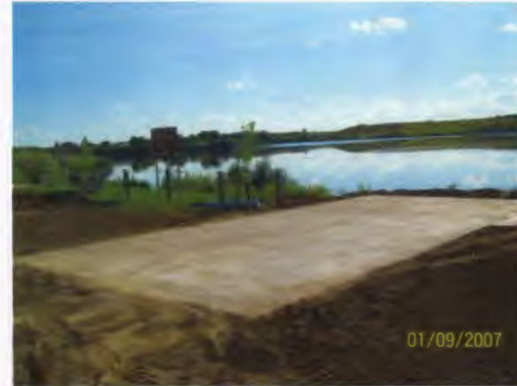
Finishing backfilling dirt