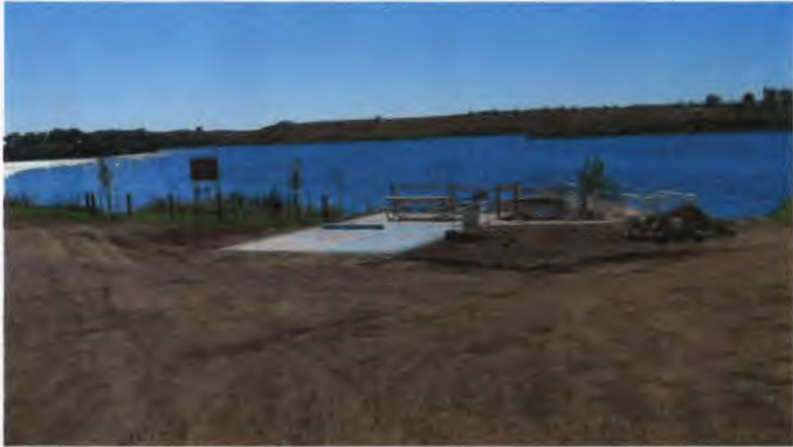
Overview of the new construction