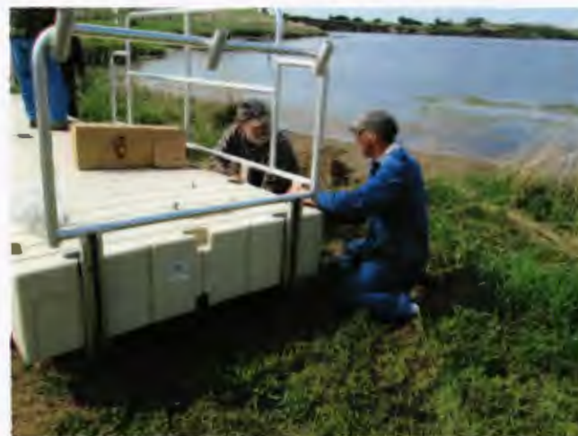
Assembling the accessible fishing pier