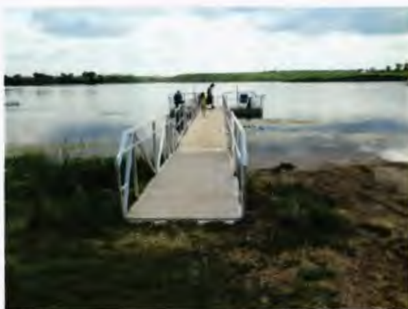
Accessible fishing pier ready for use.