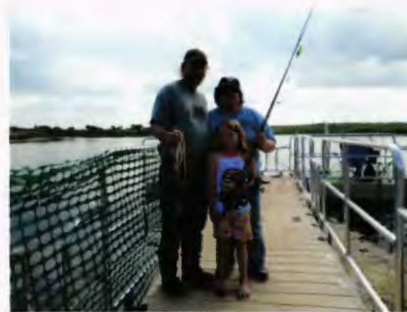
Actively used by people of all abilities.