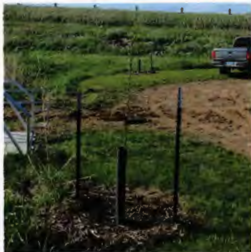
Five 8' cottonwood trees planted