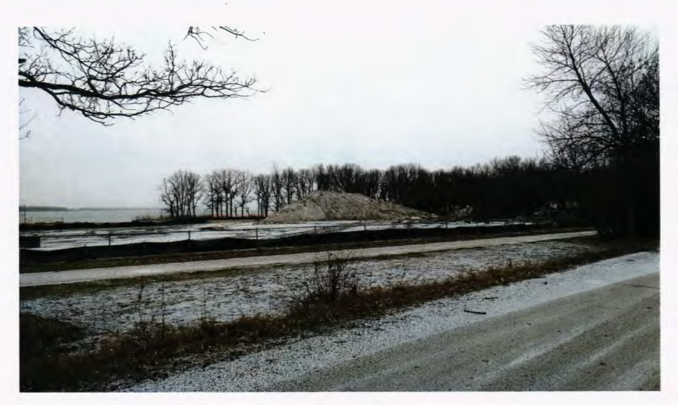
Stockpile of materials in the baseball field