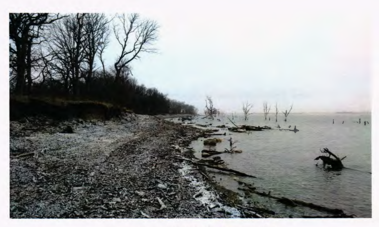
Washout shoreline before restoration