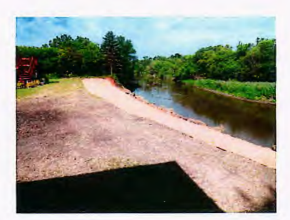
Sheyenne Riverbank Stabilization Project