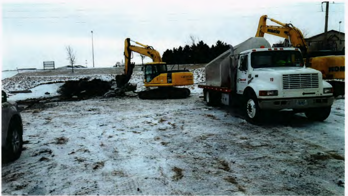
Demolition of Concrete Flange of northeast inlet (December 2016)