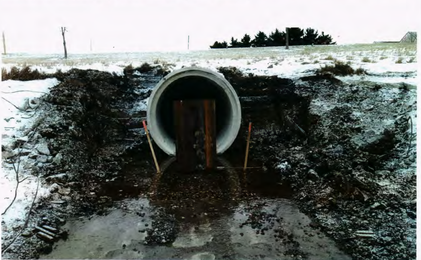
Area surrounding northeast inlet to receive boulders for stabilization (December 2016)