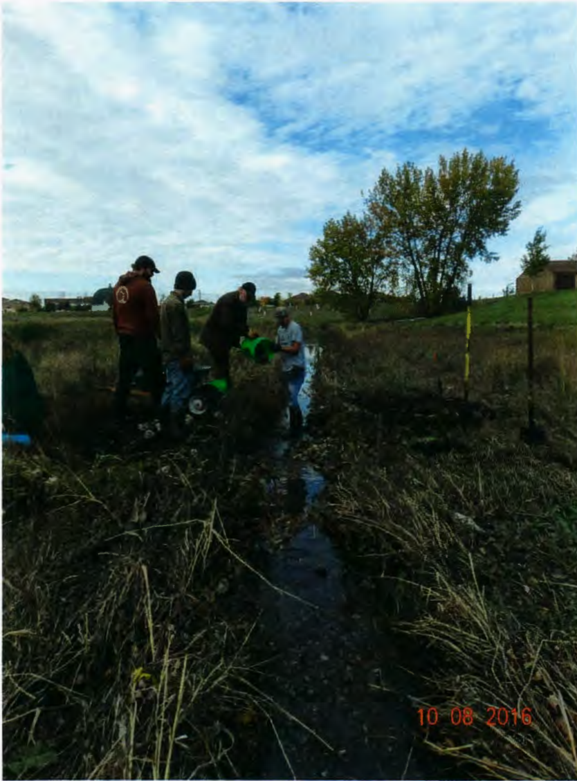
Induced Stream Meandering (October 2016)