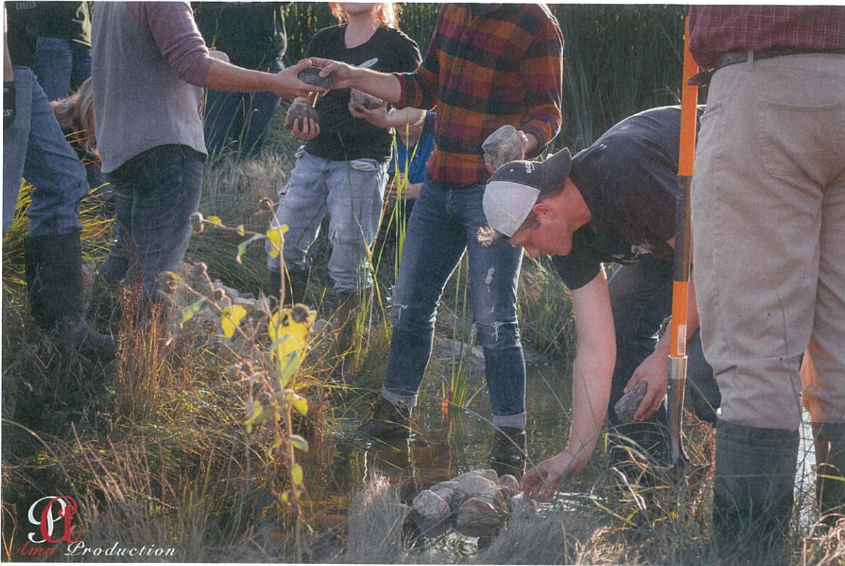
Induced Stream Meandering – September 2017