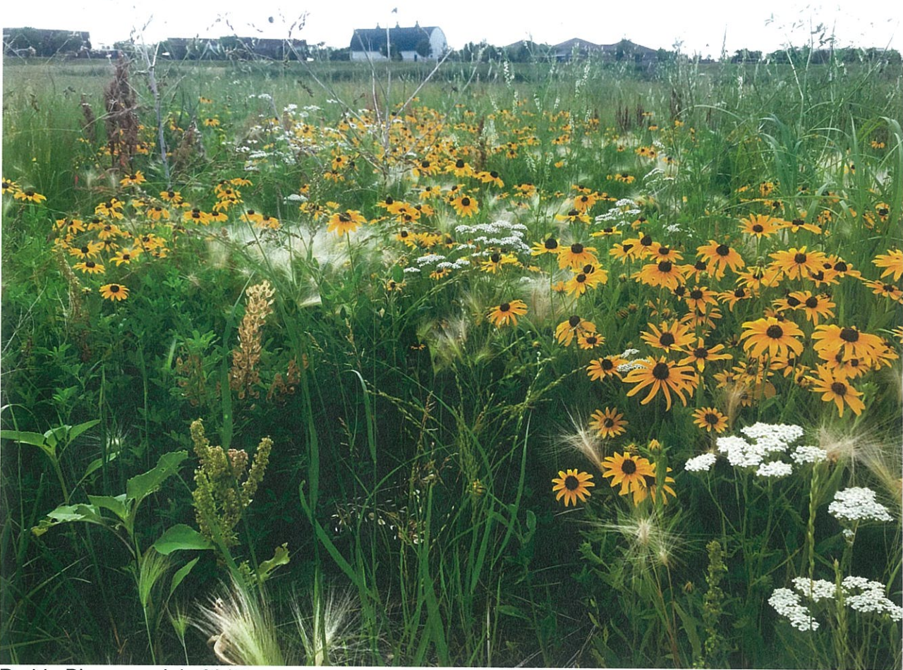
Prairie Blooms – July 2017