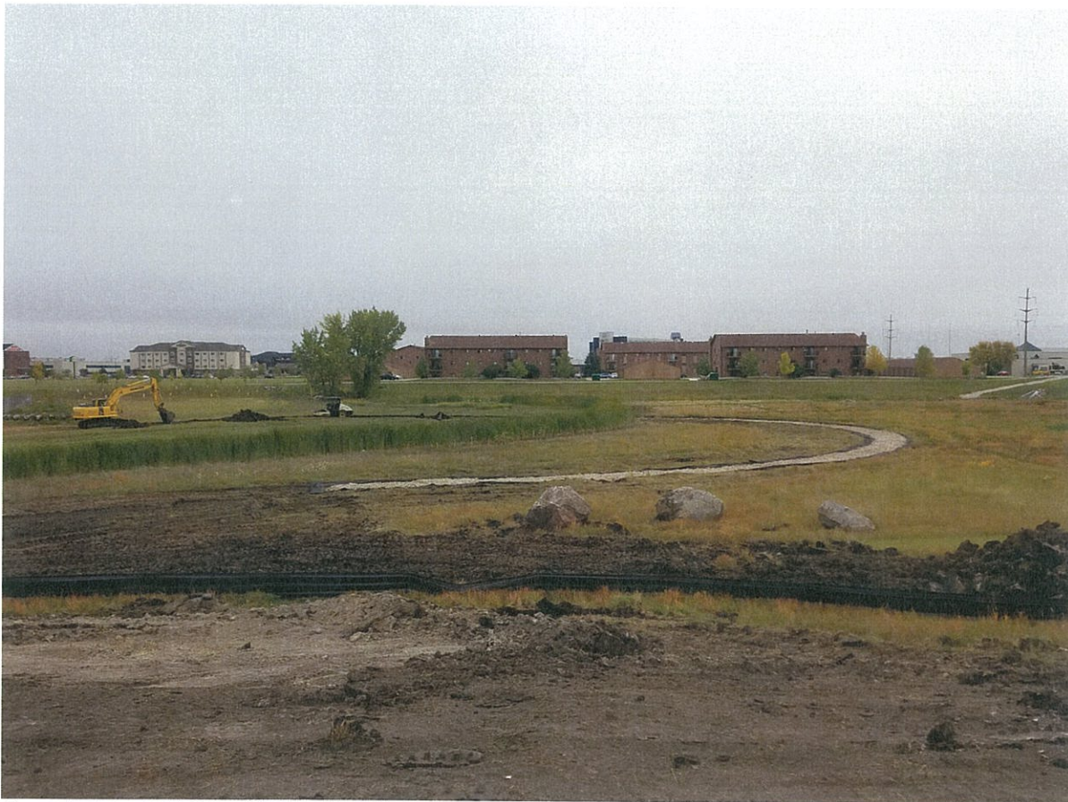
Construction of Overlook and trails – September 2017