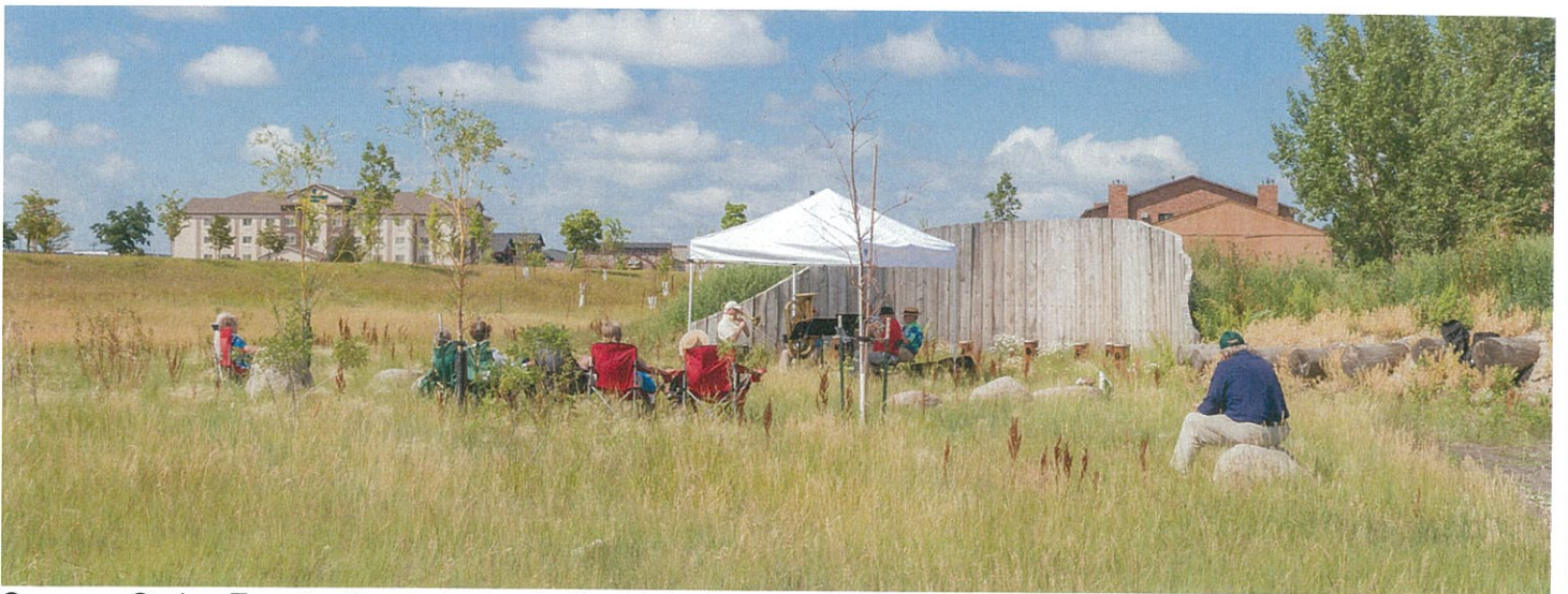
Summer Series Event – Band playing in the Listening Garden – July 2017 (outside Outdoor Heritage Funds)