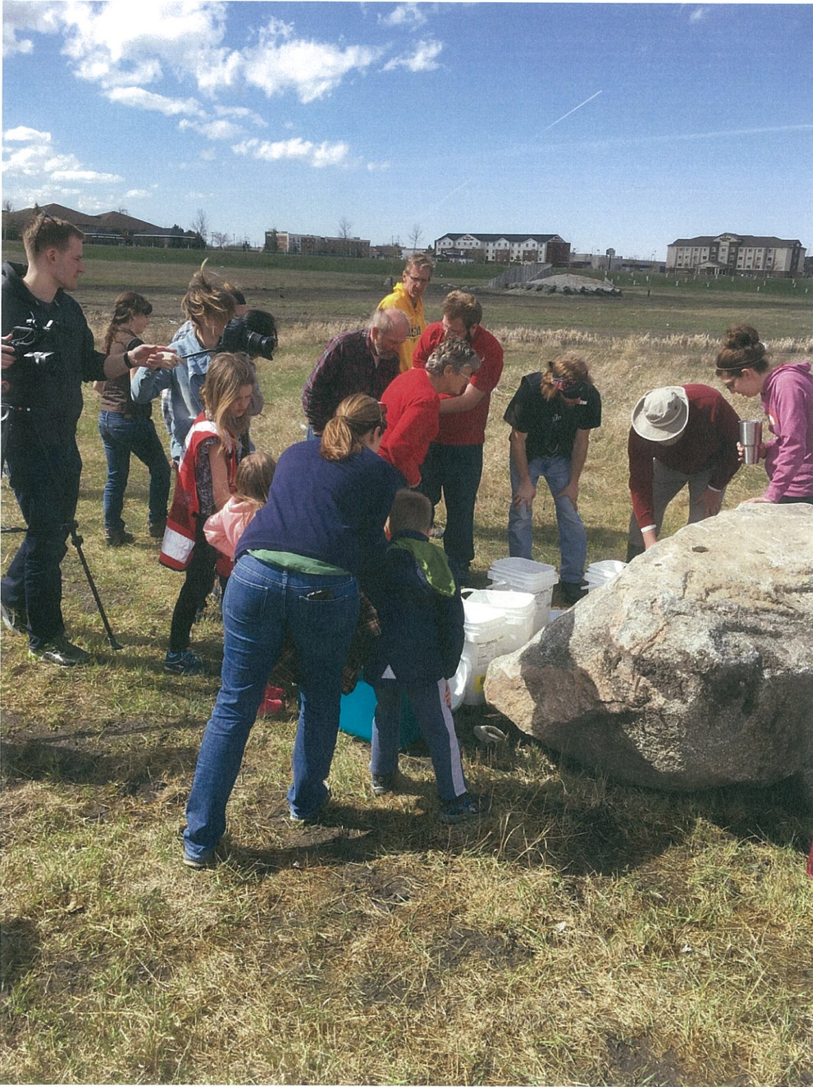
Frog and Tadpole Release – Earth Day – April 2017