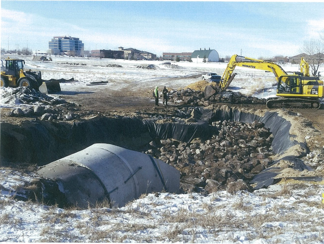
Inlet construction – March 2017