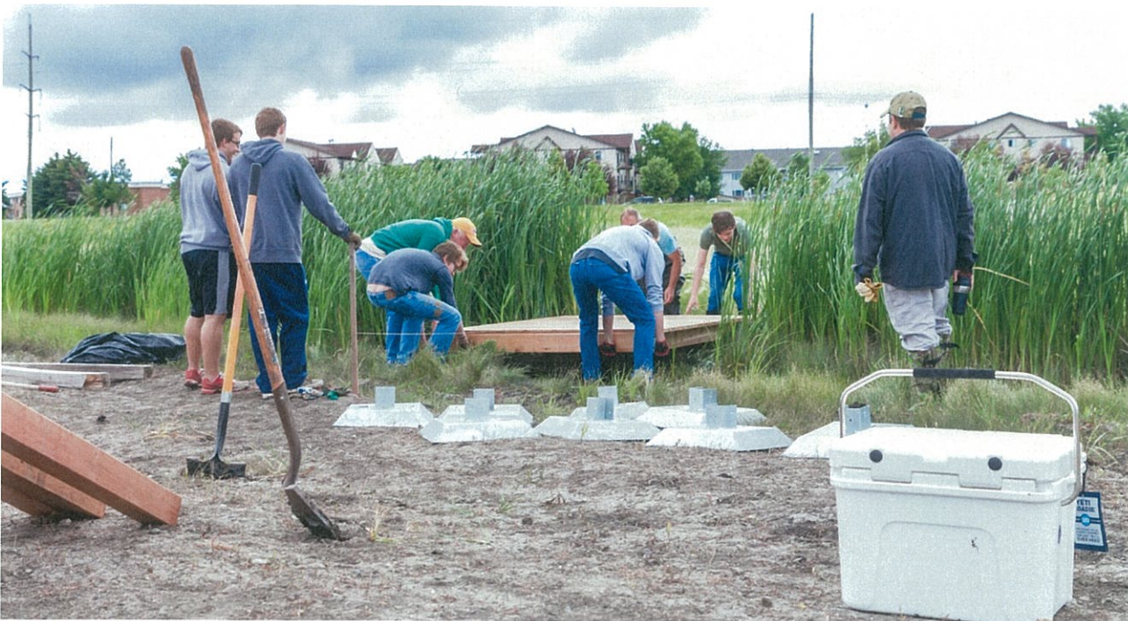
South Boardwalk Construction – April 2017