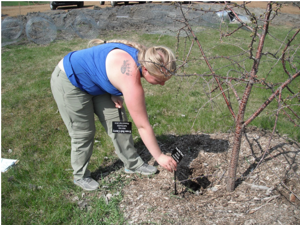
Installing tree identification labels throughout the orchard