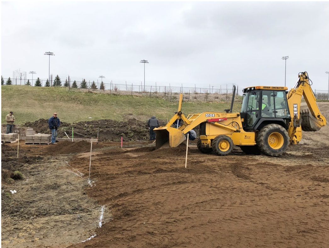
Extending the driveway and retaining wall for pathway