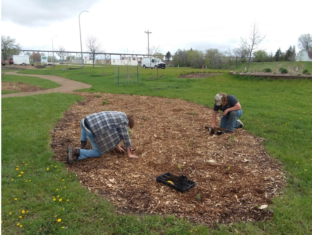
Planting Rain Garden