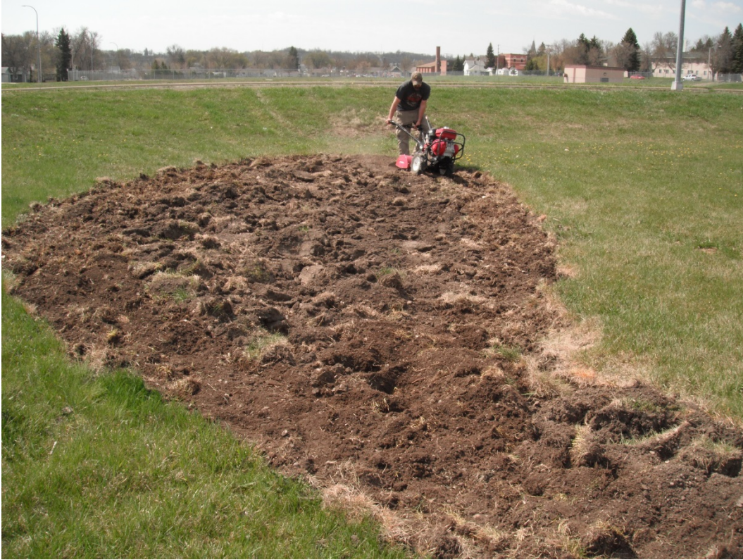
Tilling Rain Garden