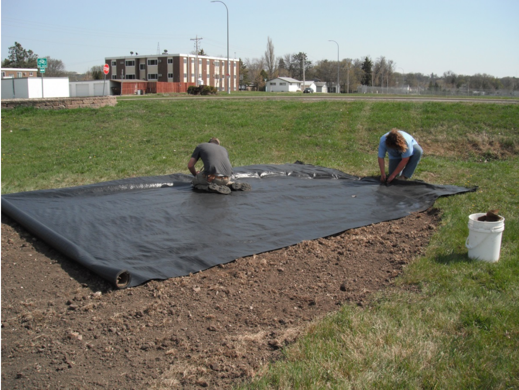
Installing landscape fabric