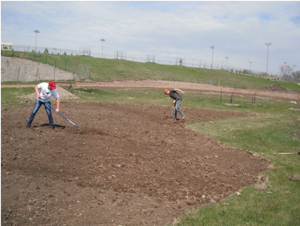
Raking out Rain Garden