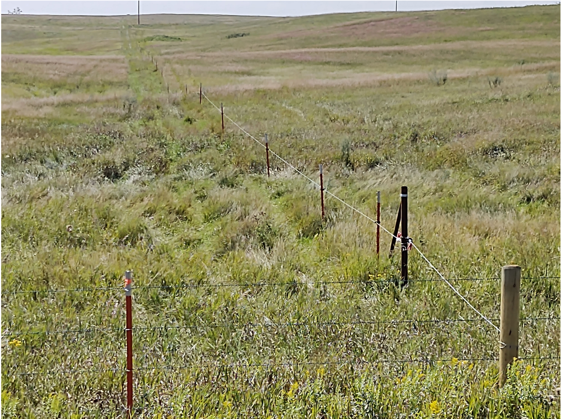
Ducks Unlimited Fencing.