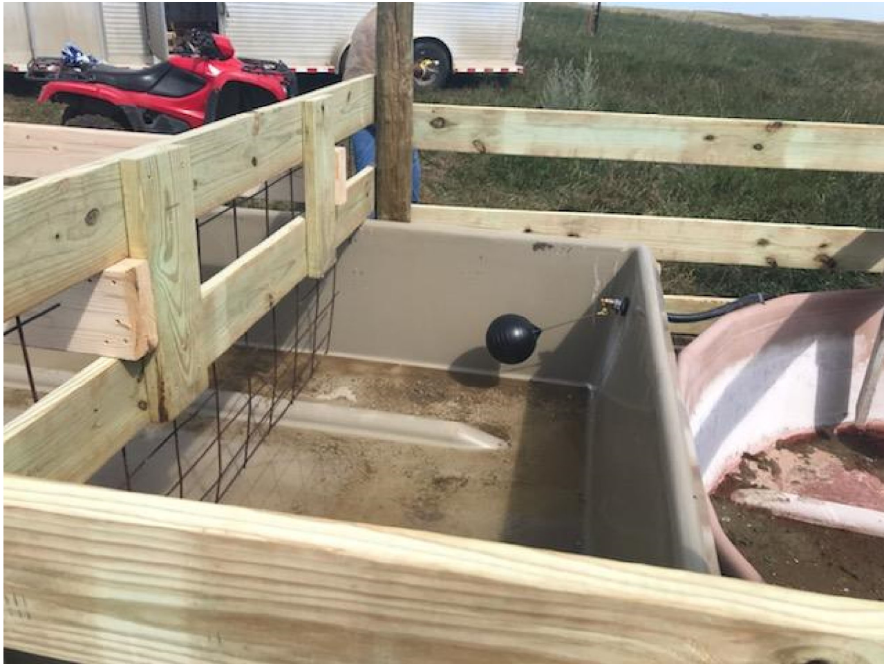
Ducks Unlimited tank.