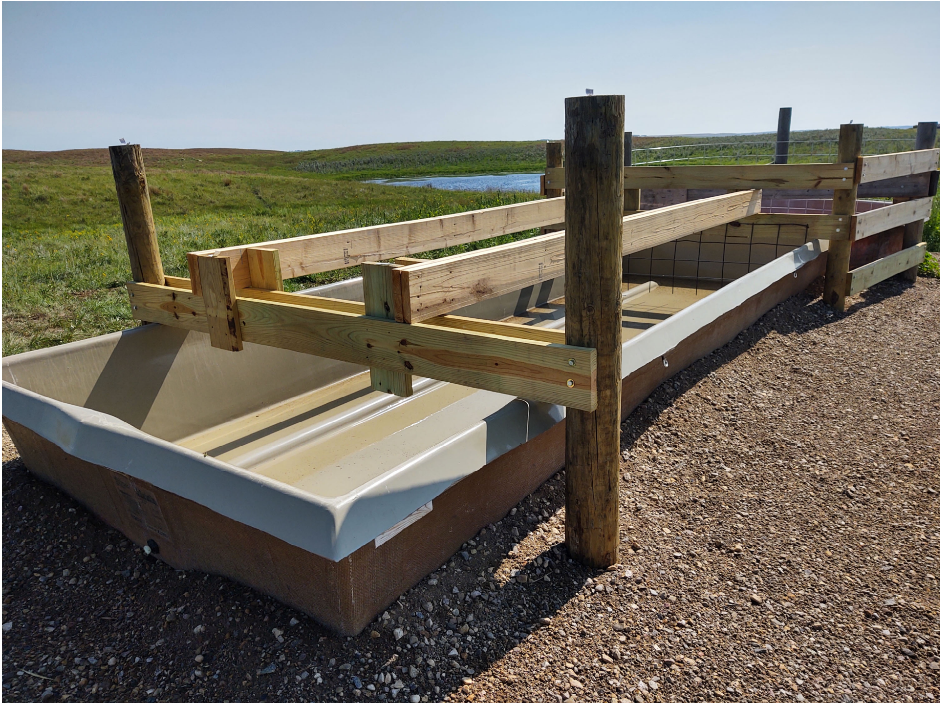
Ducks Unlimited Tank.