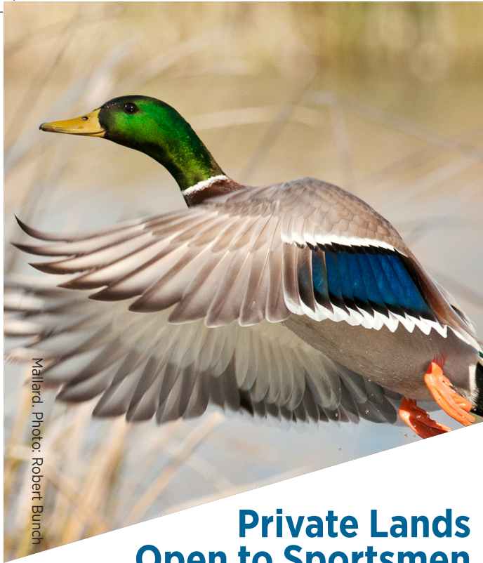
Mallard.