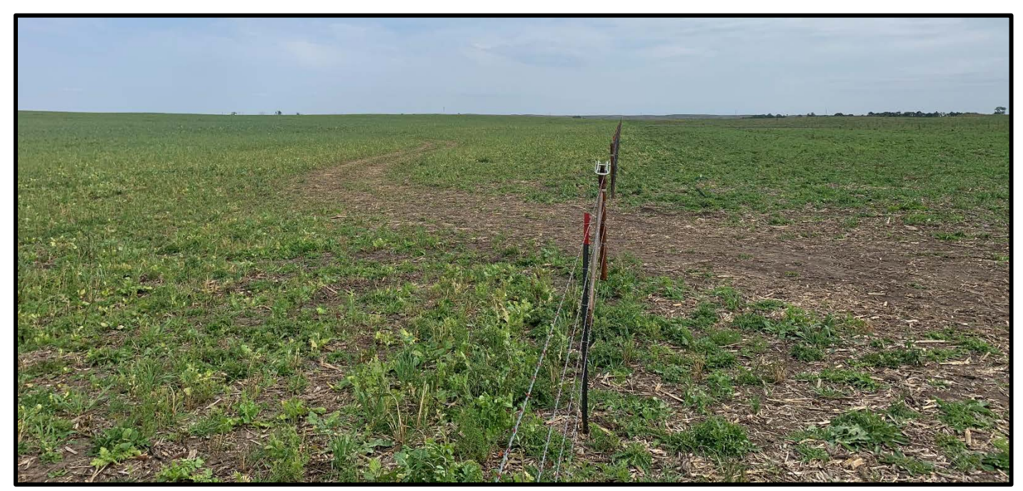
Figure 2: Thanks to North Dakota Outdoor Heritage Fund and CCLIP2, this diverse cover crop mix was planted and grazed by cattle in the fall of 2020.