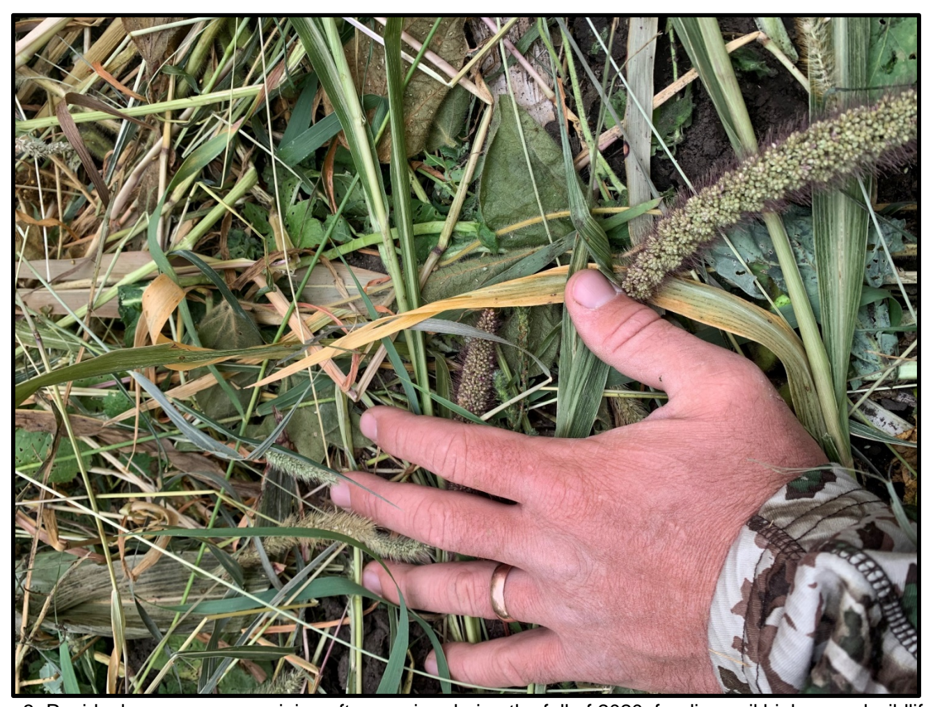
Figure3: Residual cover crop remaining after grazing during the fall of 2020, feeding soil biology and wildlife.