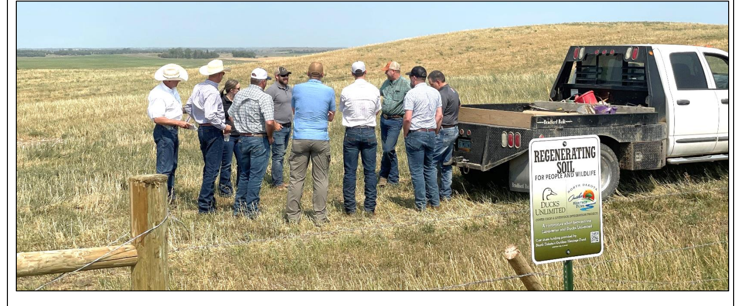
Figure 3: Ducks Unlimited's team of biologists and agronomists continue to help willing landowners monitor their soil health accomplishments on CCLIP2 project sites. Here, Ducks Unlimited's agronomist and a landowner in Stutsman County discuss water infiltration and improvements in soil function as a result of the diverse cover crop mix and grazing.

Figure 2: Ducks Unlimited and cooperating landowners continue to publicly acknowledge the North Dakota Outdoor Heritage Fund's funding of CCLIP2 projects in several ways. For example, willing landowners have placed signs like these in areas of high visibility. Those interested in learning more about regenerative conservation and the North Dakota Outdoor Heritage Fund can use the QR code on the sign. Here, an CCLIP2 cooperator shares his great CCLIP2 experience with other farmers, ranchers and conservation partners.