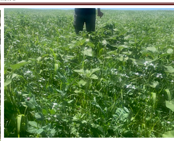
Full season cover crops planted through PATCH in western North Dakota on marginal cropland. These full season cover crops provide brood rearing cover for upland game and livestock forage in the fall and winter.