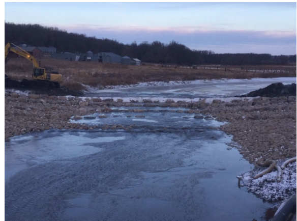
Figure 1 (12/23/2020) - Rock Riffle structure after water control removal

Rachel Contracting will continue demobilizing for the season. Seeding, restoration, as-built survey, final stabilization along with topsoil placement, and final project closeout documentation will occur during the spring of 2021.