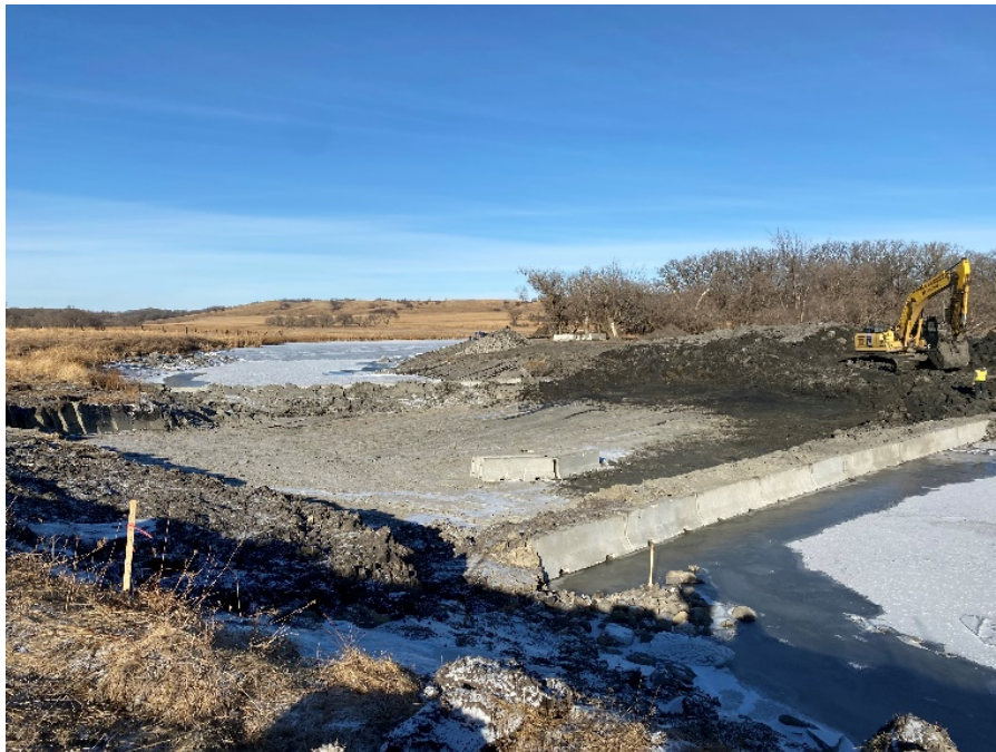
Figure 3 (12/14/2020) - Sediment removal below riffle structure footprint