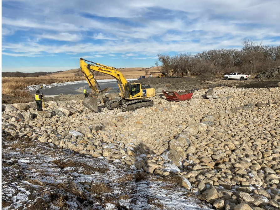
Figure 4 (12/18/2020) - Boulder installation