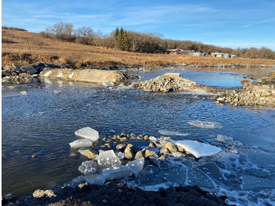
Figure 2 (12/03/2020) - Dam removal and water drawdown