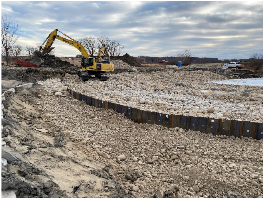
Figure 5 (12/18/2020) - Upstream sheet pile and base rock installation