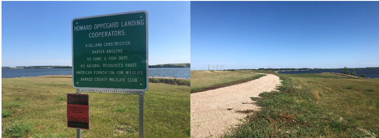
Howard Oppegard Landing – Photos from summer of 2022

Future development of this landing site would include construction of a vault toilet, development of shore fishing access through additional fishing piers (either earthen or dock style), parking lot developments, additional picnic tables, and/or tree plantings.