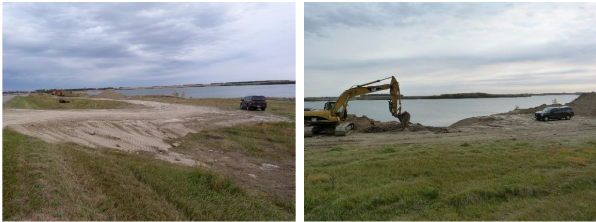
Kjelland Construction completing site developments in 2020.

grade a new road and cut a lake access into the 12-foot-high lake bank. A public access easement was then entered into with the North Dakota Game and Fish Department (NDGFD).