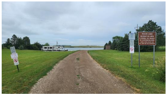
Moon Lake – Photos of location, boat ramp and access road to ramp